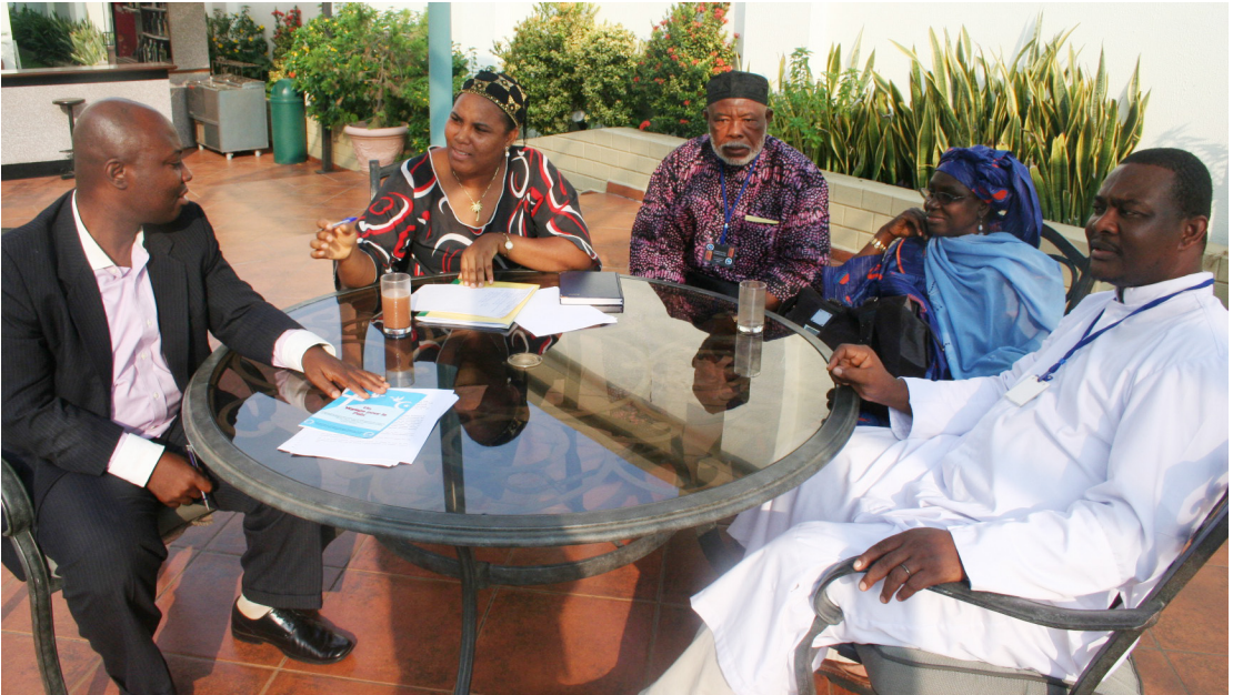
Participants in group discussion