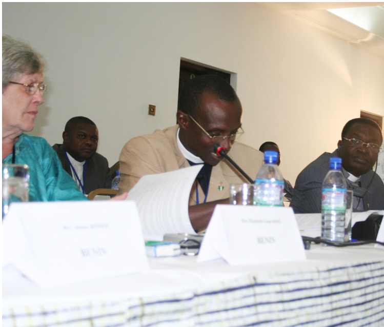
Participants engage with the presenters during the plenary discussions.