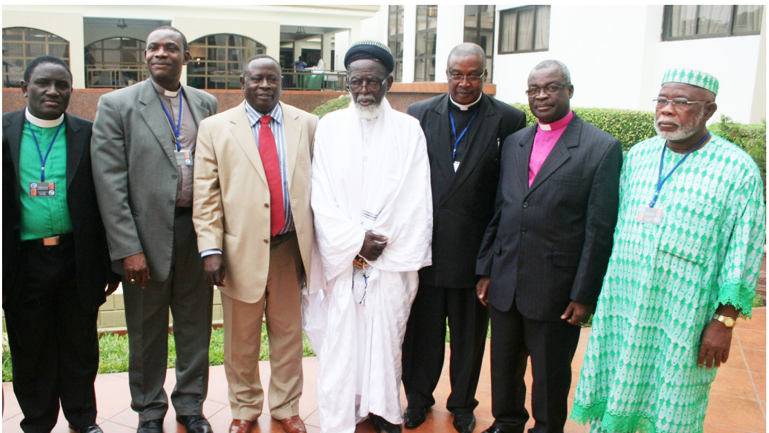
Some Participants pose for a picture with the Minister and National Chief Imam of Ghana Sheikh Usman Sharabutu Sharubutu