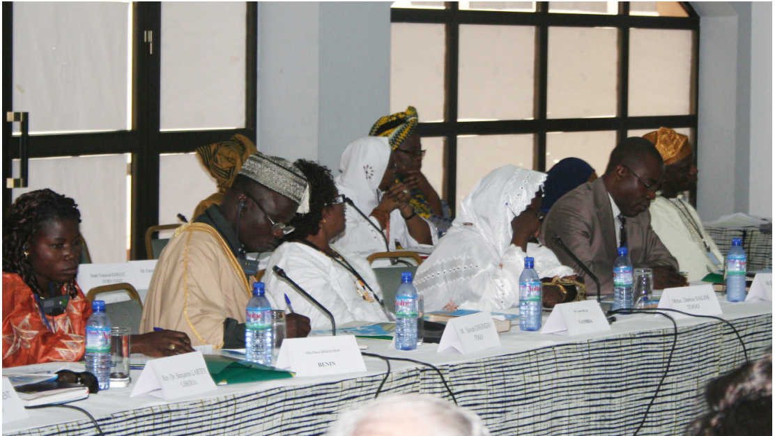
Cross Section of participants following the proceedings.