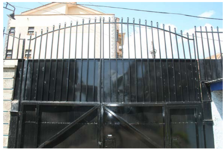
High-raised metallic gate

PROCMURA's constituencies, partners, and friends have already received a comprehensive report on the armed robbers attack on the General Adviser and his family on the night of Friday 14th March 2014 at his residence. We are grateful to God for saving our lives and enabling us to survive the ordeal. We would like to most sincerely thank our partners for the deep sense of empathy, concern, solidarity, and love shown to us when they received the news. It is worth mentioning that in the wake of the traumatising situation, as many as 5 partners from Europe and North America offered to provide a quiet environment for the General Adviser and his family to reflect and have emotional healing. Some offered to hire professional counsellors to assist us.