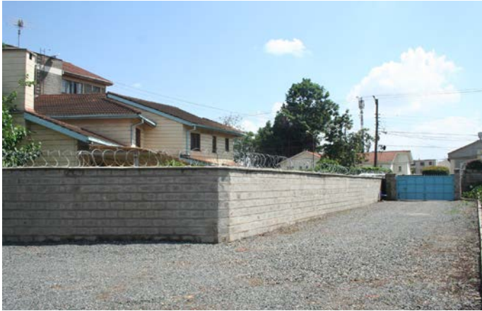
Perimeter-wall enhancement at the General Adviser's residence

Thank you all for this very practical show of concern and solidarity.