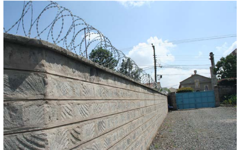
Intruder barbed wire

PROCMURA's constituencies, partners, and friends have already received a comprehensive report on the armed robbers attack on the General Adviser and his family on the night of Friday 14th March 2014 at his residence. We are grateful to God for saving our lives and enabling us to survive the ordeal. We would like to most sincerely thank our partners for the deep sense of empathy, concern, solidarity, and love shown to us when they received the news. It is worth mentioning that in the wake of the traumatising situation, as many as 5 partners from Europe and North America offered to provide a quiet environment for the General Adviser and his family to reflect and have emotional healing. Some offered to hire professional counsellors to assist us.