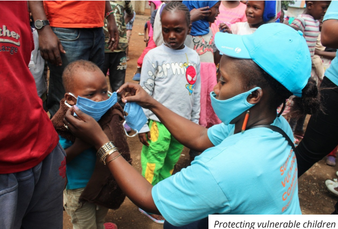
Protecting vulnerable children against Covid-19