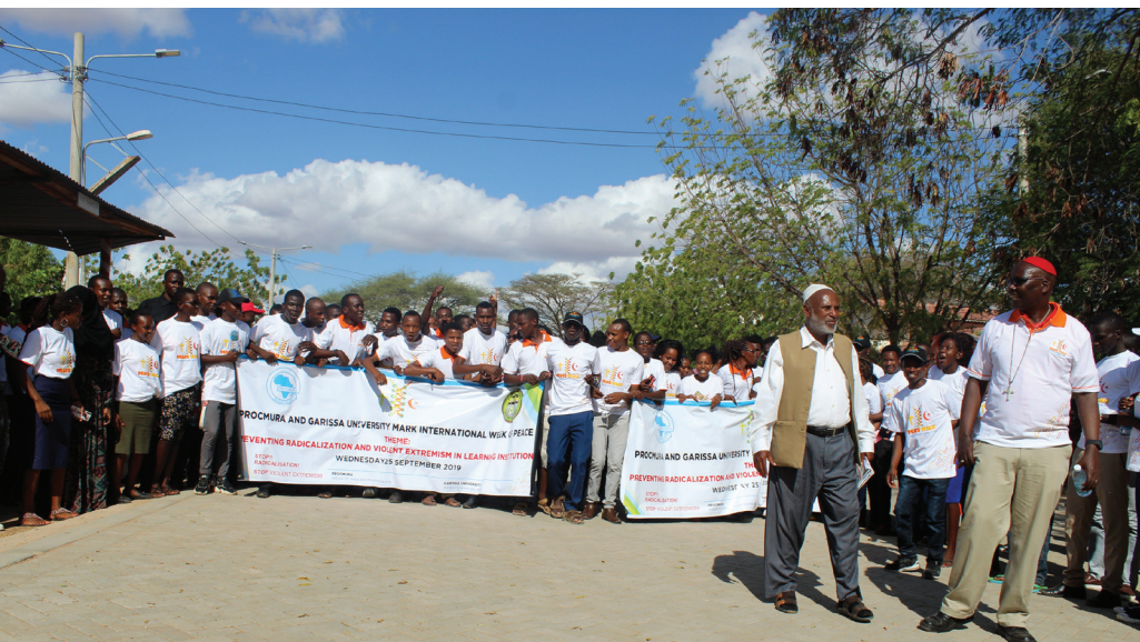
Public Campaign against radicalization and violent extremism