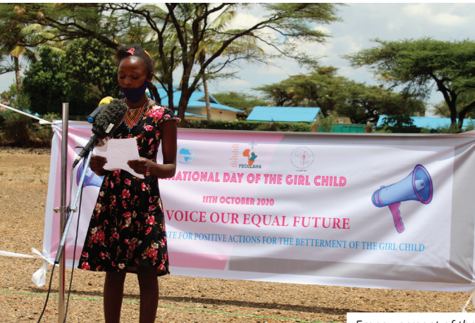
Empowerment of the girl child