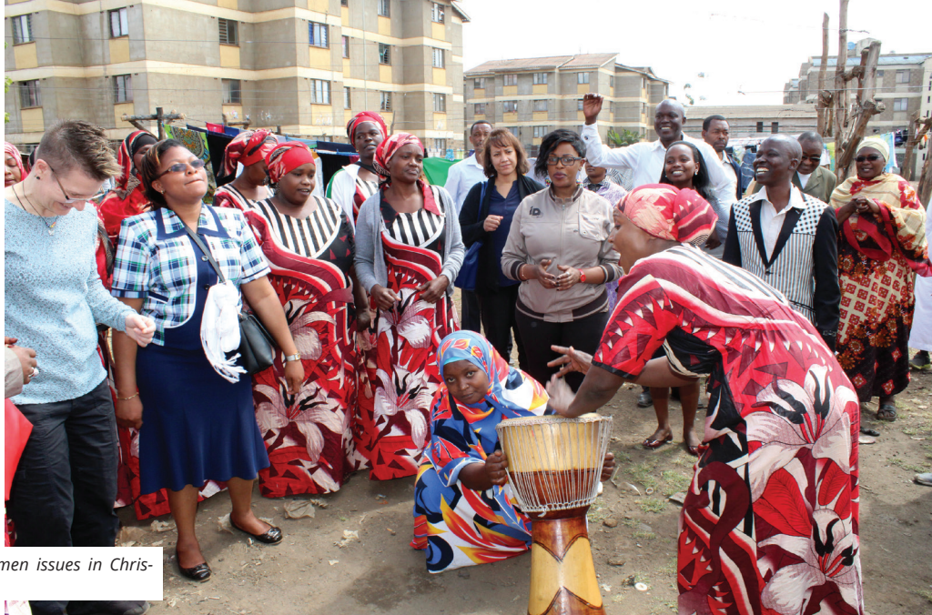
Capacity Building on women issues in Christian-Muslim relations