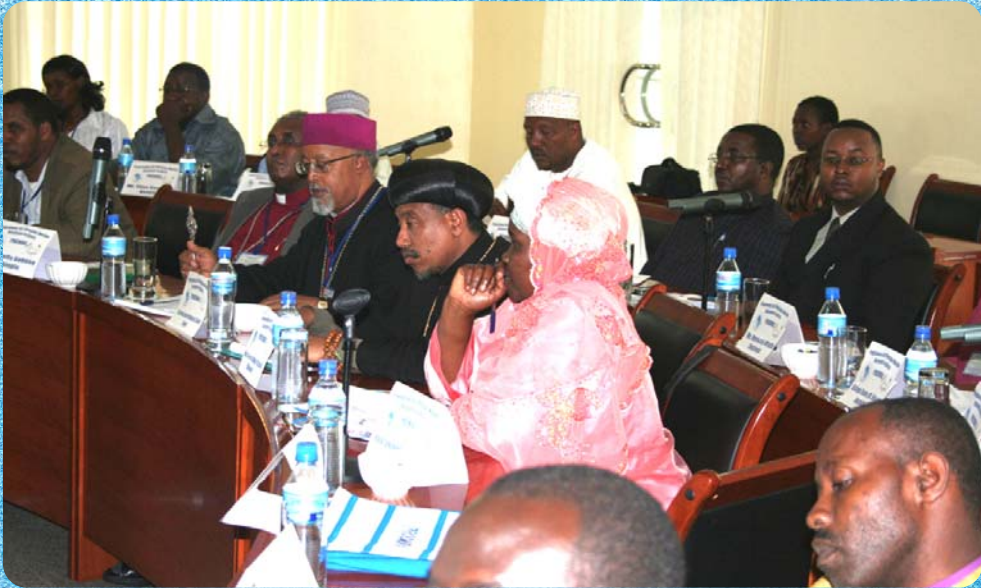
A section of participants

independence/liberation movements to ensure good relationships between the religious communities so as to live together peacefully.