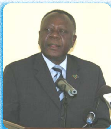
Hon. Samuel Sitta