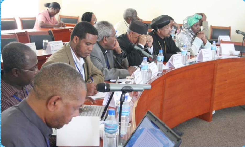
Participants at the session

between the two countries. Somalia is in a class of its own as there are no antecedents in modern history where a country could go without a government for over 17 years. A homogeneous community in terms of language, religion and culture, its people began to divide themselves into clans, sub clans and then into families. The African Union is currently involved but faces the failure of the international community in providing adequate resources to deploy an adequate force in the country. Somalia is almost like an orphan with the major international powers having little interest in resolving the conflict. However, no one can impose peace in Somalia. There is need for political will among the political actors and the people of Somalia. The international community has a responsibility to help Somalia and stop the cycle of death and the miserable conditions the people of Somalia are living in.