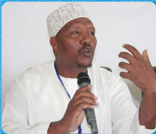
Sheikh Ibrahim Lethome of the Supreme Council of Kenya Muslims

Sheikh Ibrahim Lethome chaired the plenary session. He quoted a verse from the Qur'ân that says that: 'God will not change the situation of a people/ community until they themselves do something about it'. He indicated that all