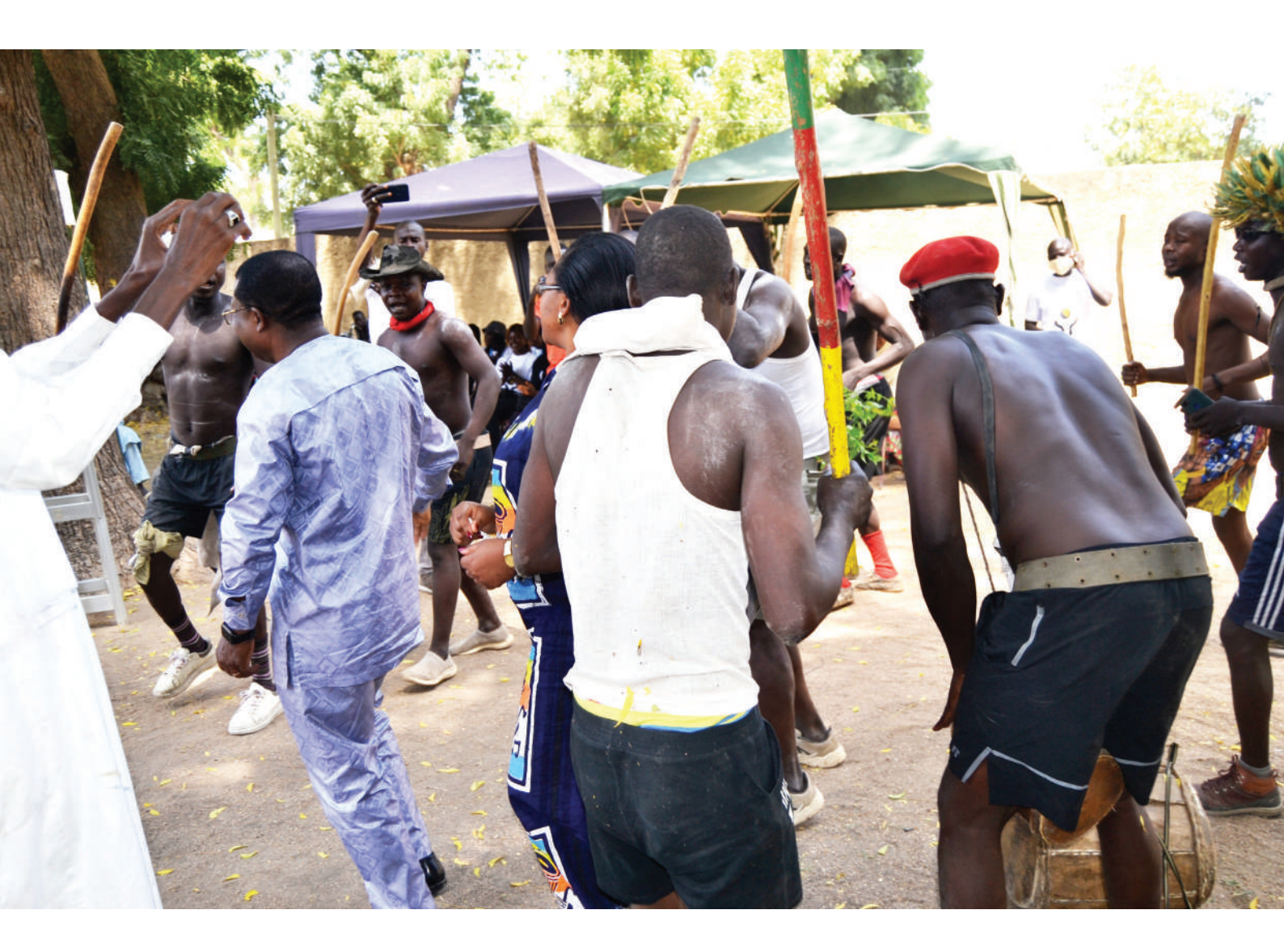
Celebration of Cultural and religious diversity in maroua, Cameroon

Christian and Muslim religious leaders, traditional leaders, and representatives of the PROCMURA inter-religious networks and government institutions. This event took place on the 20th of October, 2022.