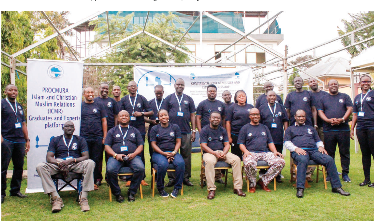
ICMR graduates and expert meeting in Arusha, Tanzania

PROCMURA organised a three-day hybrid (physical and virtual) continental ICMR workshop under the theme: "Continental Analysis of Christian-Muslim Relations in Africa: Challenges & Opportunities as Existential Realities of the Past, the Present, and the Foreseeable Future" to, among other things, create space for and bring together all Islam and Christian-Muslim Relations graduates and experts from across the continent and beyond in a concerted effort of making sure that they are not only interconnected but also have a coordinated approach in addressing contemporary issues in Christian-Muslim relations in Africa.