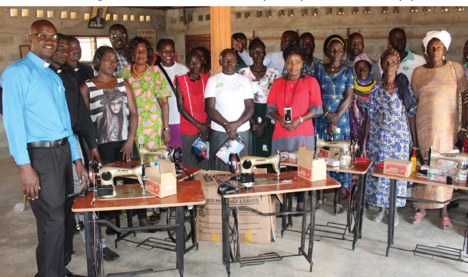
Some PROCMURA staff at the Women Empowerment centre in Turkana, Kenya

PROCMURA believes that the empowerment of women and the girlchild is a critical factor in addressing some of the challenges faced by women as the girls eventually grow from the tender teenage age to mature women within no time. To mitigate these challenges, and the unprecedented rise of teenage pregnancies among vulnerable communities in Africa, among other effects of violent conflicts, accentuated the need for PROCMURA to have active discussions under its women programme to address the plight of the girl child. In late December 2021 and early January 2022, PROCMURA, in partnership with the reformed Church of East Africa and partners in Germany from the Evangelical Lutheran Church in Germany, began a mission to roll out and establish women empowerment centres through the churches in the far northern part of Turkana Kenya which is one of the difficult terrains in the country. It established centres in Paroo, Sarmach (West Pokot County) Lokichar, and Kainuk (Turkana County). In addition to these, three (300) hundred girls and young women from the above communities of Turkana and West Pokot received a "Kike Health Kit" with reusable sanitary towels and accessories for the girls' use which were also given as a donation to the girls. The RCEA Rehabilitation and Development Department will oversee the project.