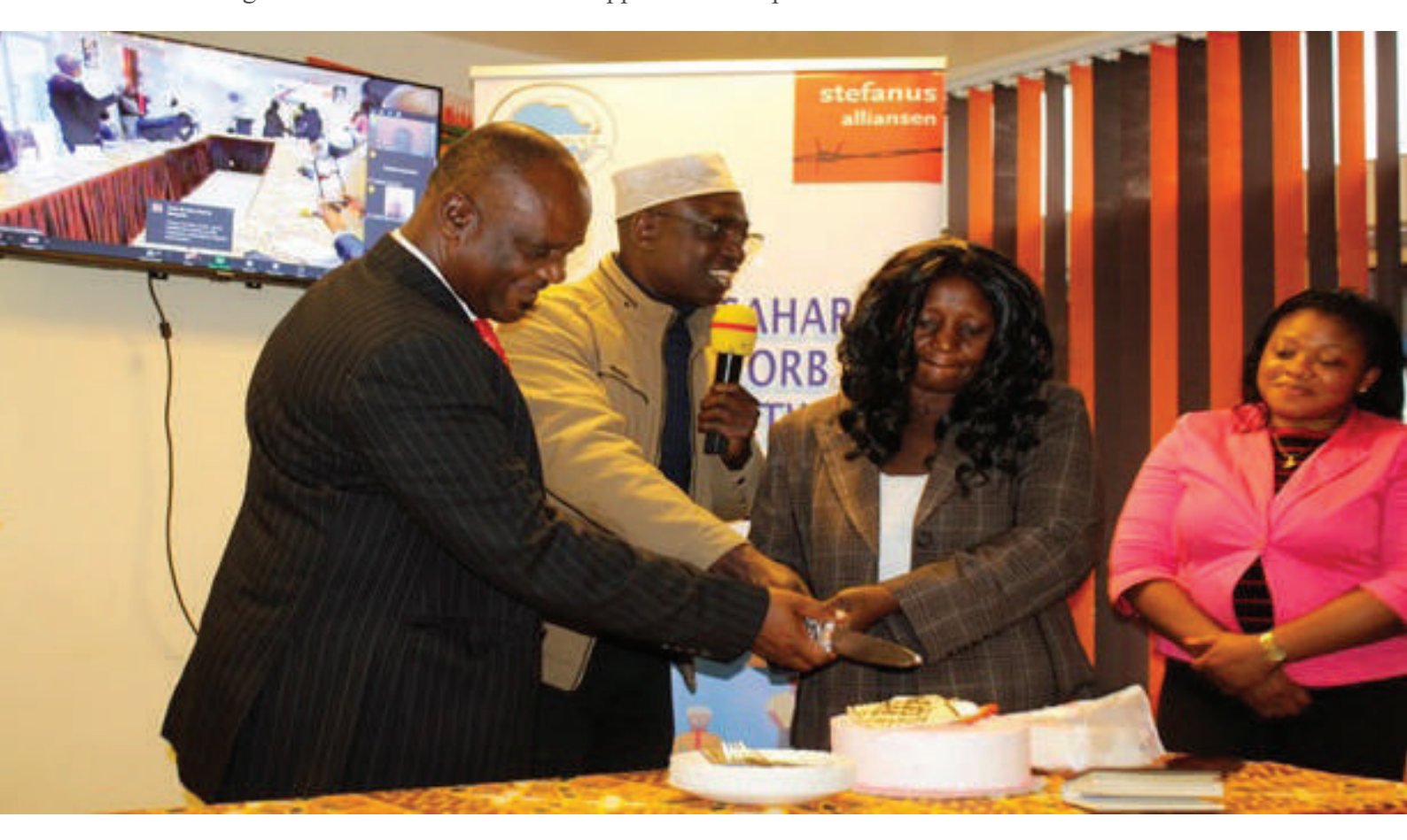
Launch of the Sub-Sahara Africa FORB trainers network

PROCMURA coordinated the launch of the sub-Sahara Africa FoRB trainers network. It was a hybrid meeting, which physically brought FoRB trainers in Kenya to the PROCMURA conference hall while the rest of the trainers across the continent joined online. The meeting took place on the 15th of November, with 86 trainers attending the launch and expressing their willingness to cooperate with other trainers. The meeting ended with the coordinators' appointment to pilot the network's work.