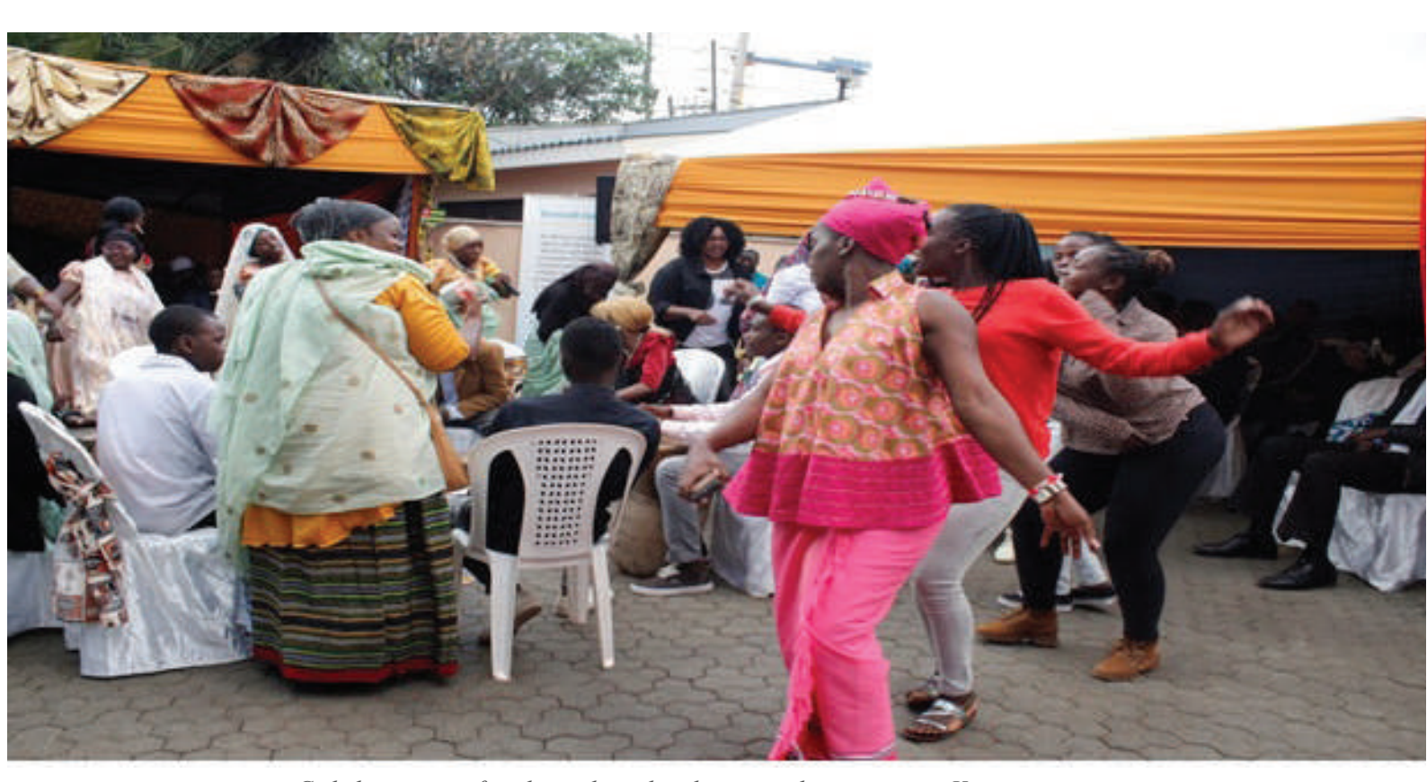
Celebration of cultural and religious diversity in Kenya

The various religious and cultural groups did presentations in dancing, singing, recitation of the Quran, and bible memory verses. The event then took a continental approach as delegates for the executive committee meeting and Area advisers showcased their traditional regalia from various countries. The take-home message was that diversity is not a problem but a blessing and must be celebrated.