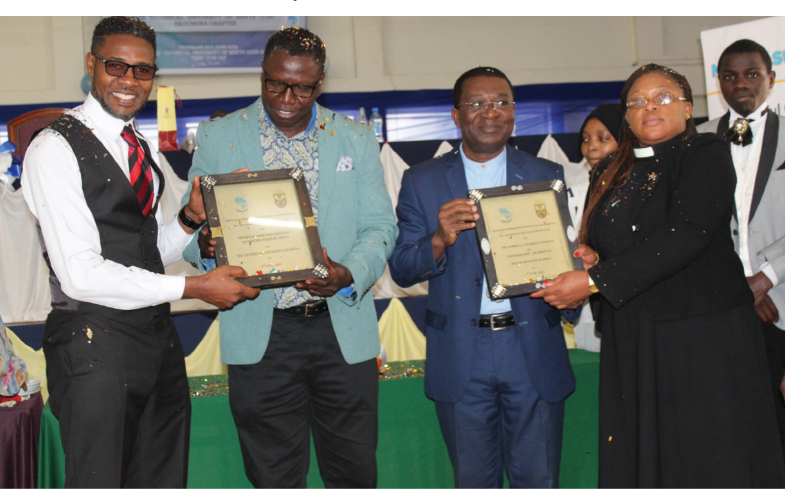
Launch of TUK-PROCMURA Chapter

The students were commissioned as peace ambassadors.