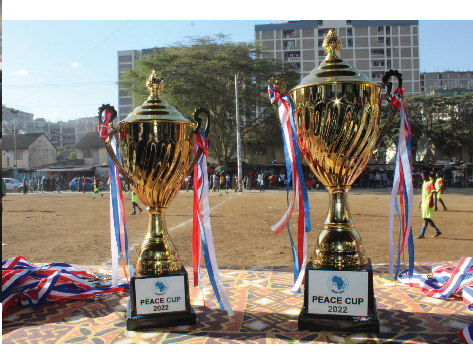
The PROCMURA peace tournament in celebration of the successful peaceful 2022 elections in Kenya

The campaign aimed at educating and sensitising members of the public, especially the youth, on the need and importance of maintaining peace ahead of, during and after the General Elections that were held on the 9th of August, 2022. The campaign, which took ten days of door-to-door visits and engagement with the community, targeted the communities that had over the years experienced violence during elections, such as Kibra, Mathare, Kawangware, and Kamukunji using Peace Caravans, focus group discussions sharing experiences and best practices over a hot a cup of tea, and football matches among others. It is essential that as a result of these campaigns, PROCMURA made the clarion call to all and sundry to join together and talk peace and contribute to the need for peace, as without peace, there can be no development. While the elections were peaceful, PROCMURA celebrated this achievement and contributions during the International Day of peace.