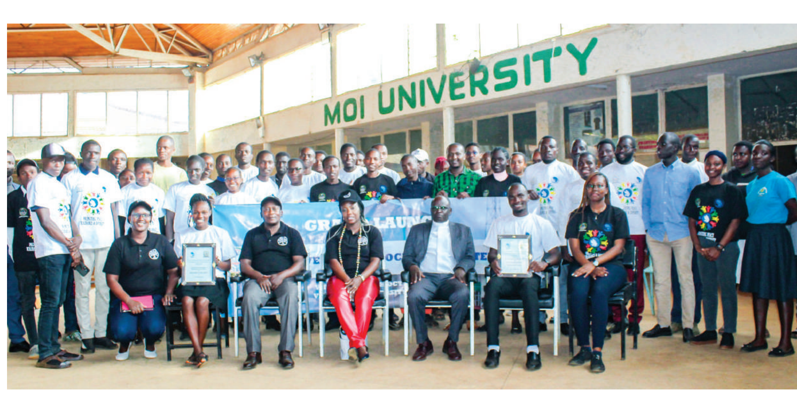
Moi university, PROCMURA Chapter

PROCMURA launched the PROCMURA Moi University chapter as a club on the 26th of October, 2022. The PROCMURA management and the Office of the Dean of Students for Moi University presided over the launch. Fifty (50) students and some University administration representatives witnessed the launch.