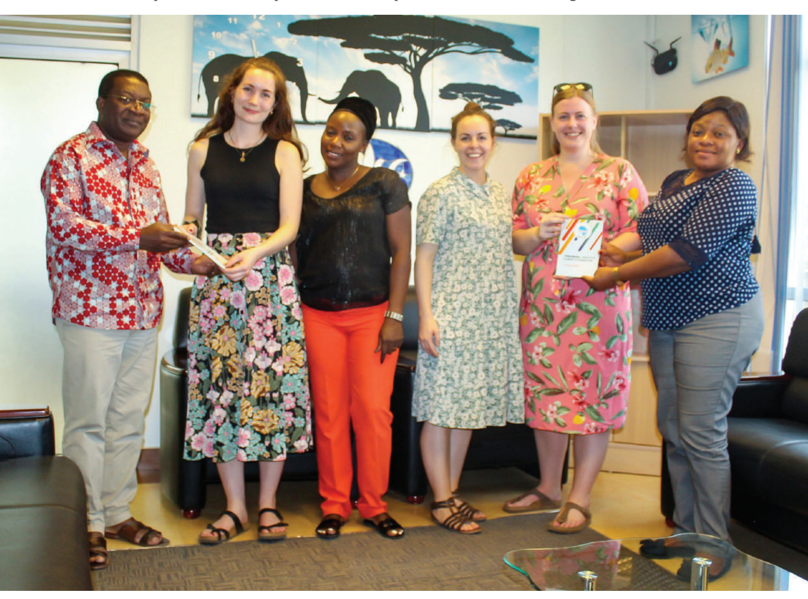
Some PROCMURA and Stefanus Alliance International staff at the PROCMURA Central office

On the 3rd of March 2022, PROCMURA entered a new partnership with Stefanus Alliance International, a Norwegian Christian Mission and Human Rights organisation. The partnership would focus on establishing a regional network for FoRB trainers in Africa. The network will create a platform where FoRB trainers can come together as resource persons to share experiences and best practices on freedom of religion across the continent.