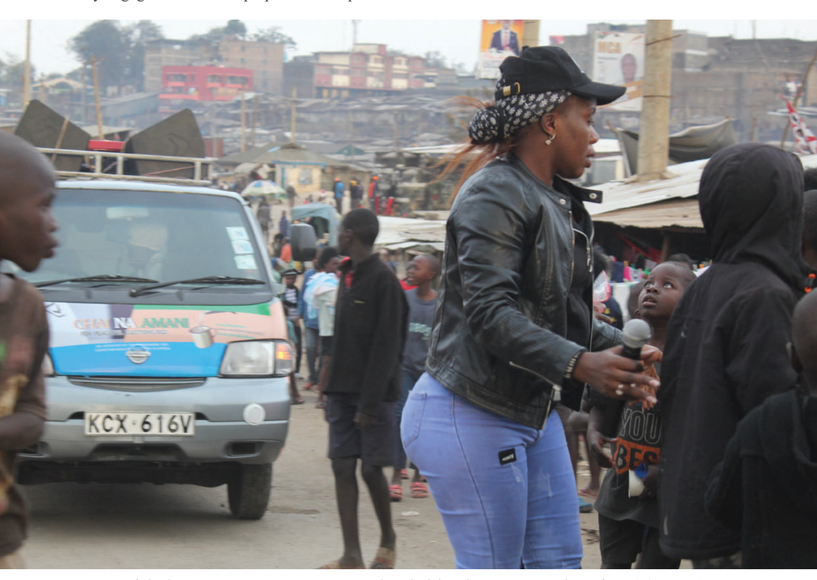
Peaceful election campaigns in Kenya headed by the Team-Leader of PROCMURA

Violence around the time of elections is common in Kenya and other countries across Africa and the region at large. Most elections in Kenya have been marred with post-election violence creating untenable complex situations for the citizens. Since the introduction of multiparty politics in 1992, all successive elections have been highly competitive and polarised mainly because political parties and coalitions are organised along tribal lines. The youth have been primarily identified as one of the social groups most visibly engaged and used to perpetrate and spread violence.