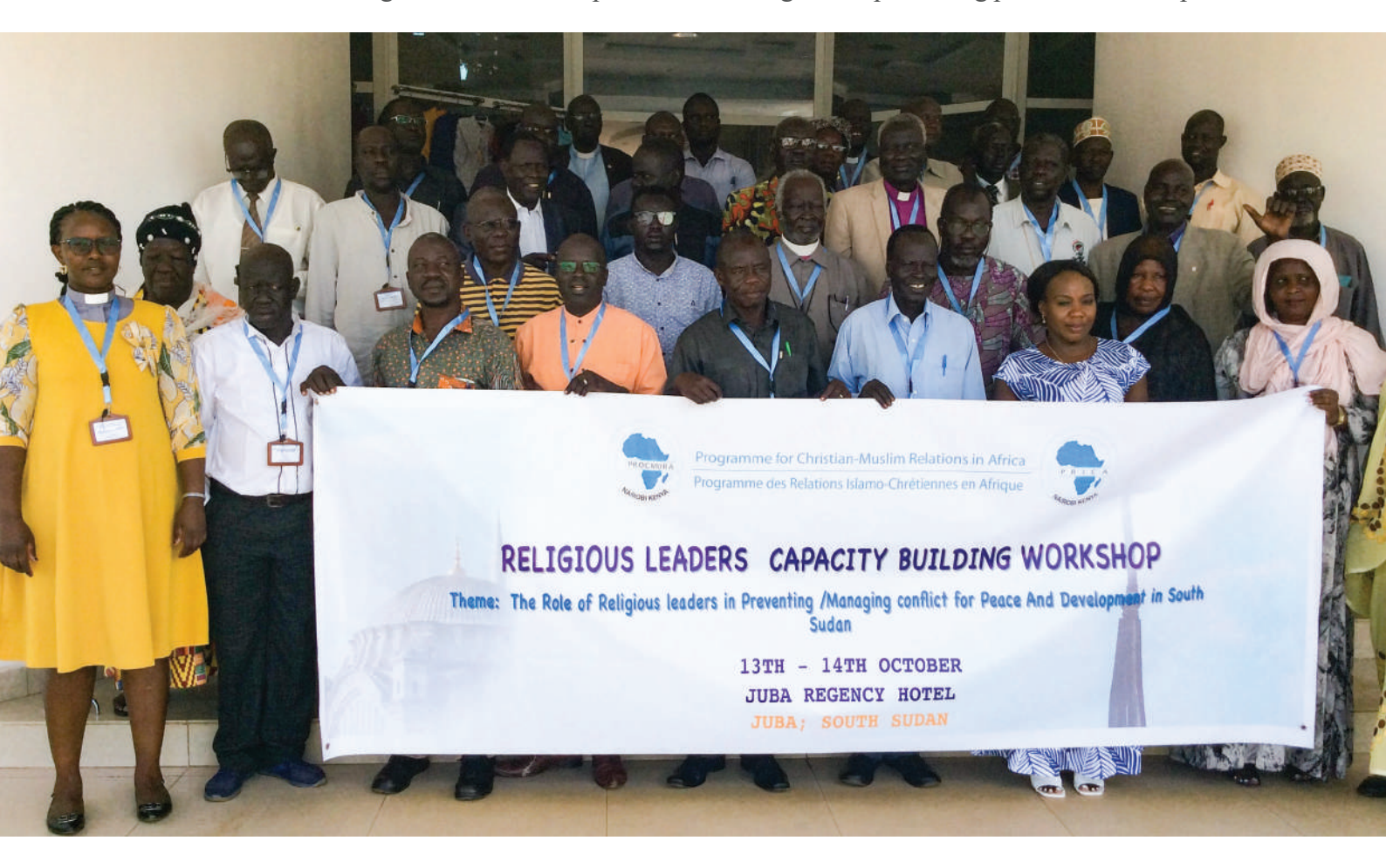
A Group photo of religious leaders in South Sudan

Forty Christian and Muslim leaders were brought together for a two days workshop on "The role of Religious Leaders in Preventing/Managing Conflict for Peace and Development in South Sudan" on 13th and 14th October 2022 at the Regency Hotel in Juba. The workshop aimed to build the capacity of religious leaders as agents of peace and development in South Sudan, which has been affected by long-term violent conflicts. The Religious leaders discussed in detail the implications of the Unity government's extension of the Peace Agreement by 24 months and its effects on the people of South Sudan. They agreed that it is their role to enlighten the people at the grassroots in understanding the context of the extension and strengthening peace and social cohesion during the extension period and beyond. At the end of the workshop, the religious leaders were awarded certificates of participation. The religious leaders also formed a Christian-Muslim Network in South Sudan to promote unity between Christians and Muslims in South Sudan in addressing issues of Conflict prevention/Management, promoting peace and development.