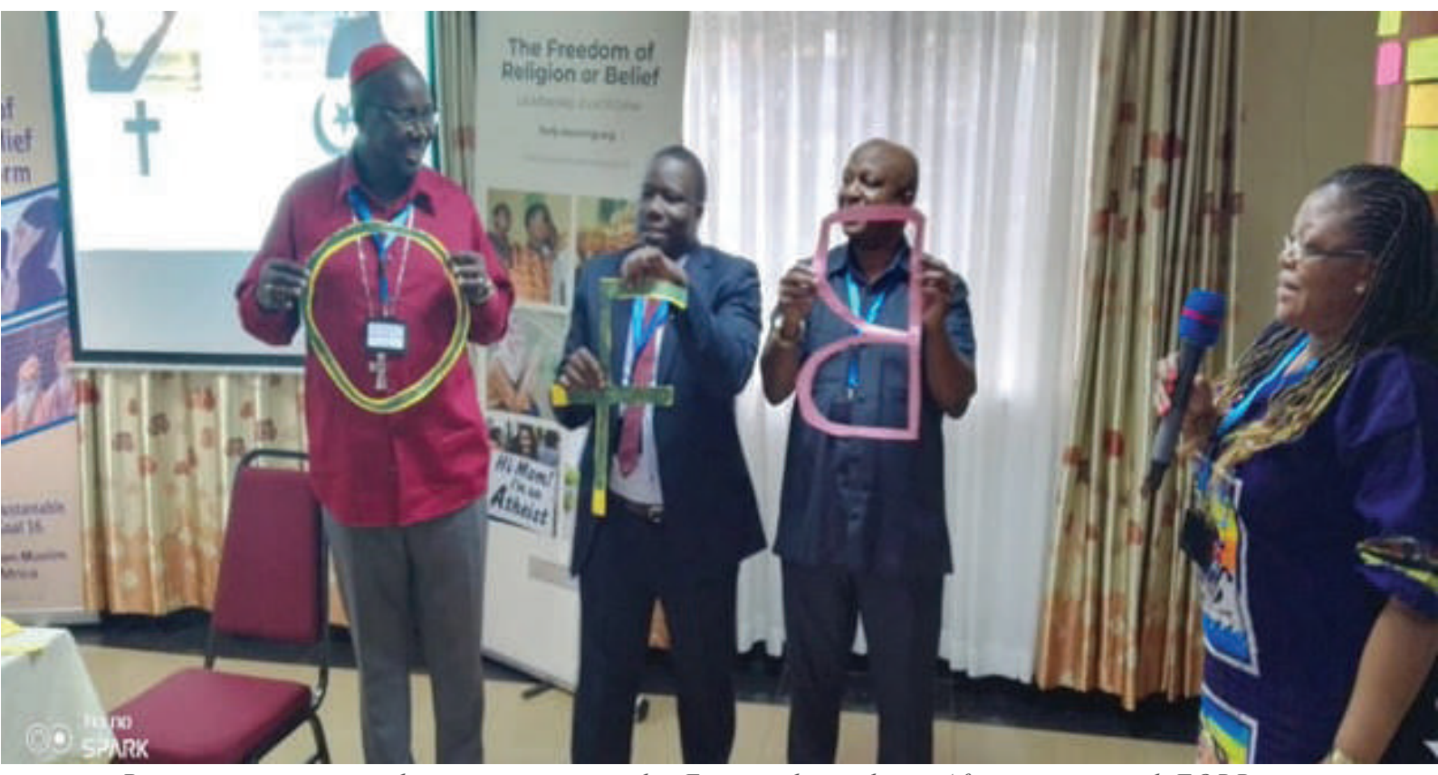
Participants engaged in activities in the East and southern African regional FORB TOT in Uganda

The TOT took place in Kampala, Uganda, from the 14th to the 17th of August, 2022. The training brought together 46 participants of religious leaders, women, youth, legal practitioners, and the media from Five (5) East and Southern African Countries of Kenya, Uganda, Malawi, South Sudan, Ethiopia, and Tanzania. Topics discussed include the following: Introduction to FoRB, Limitations to FoRB, FoRB from a legal perspective (Human right), FoRB in faith Perspectives (Christianity), FoRB in faith Perspectives (Islam), Group Discussions and case studies on FoRB violations, Government restrictions, social hostility and FoRB, FoRB and women, FoRB Experiences from the Field, and skills in promoting FoRB. The training ended with a closing ceremony. The reading of the statement of commitment, presentation of action plans, evaluations, and presentation of the certificates of participation marked it.