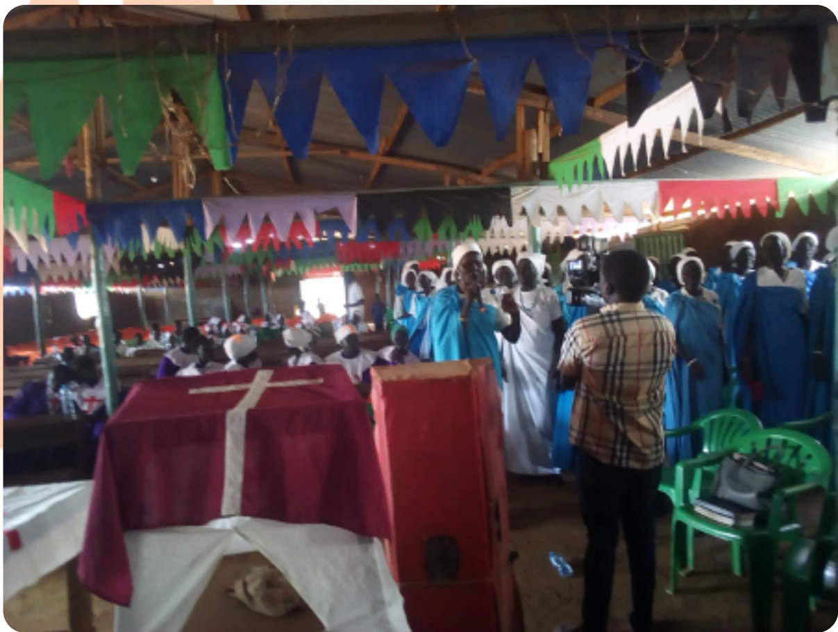
Prayer Session held in camp 3 of the IDP camps