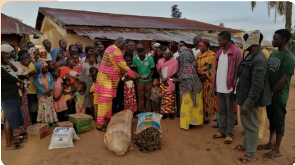
Women and Children from Zikpa village In Zonkwa receive donations from the PROCMURA committee.