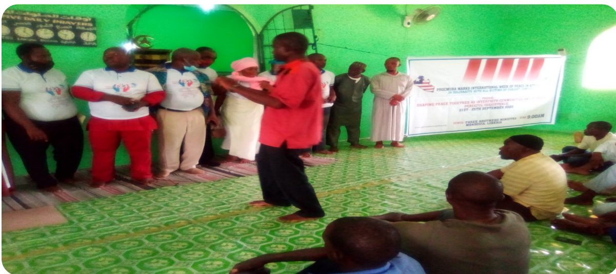
Prayers for peace conducted by the PROCMURA Area Committee at the 72nd Mosque