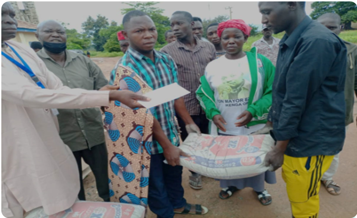
Youth receiving Bags of Cement to assist in construction of their demolished houses