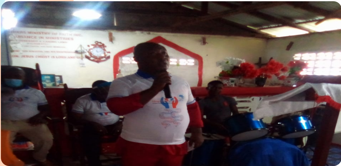
Service at the Three Brothers Ministry Church Benson street, Monrovia.