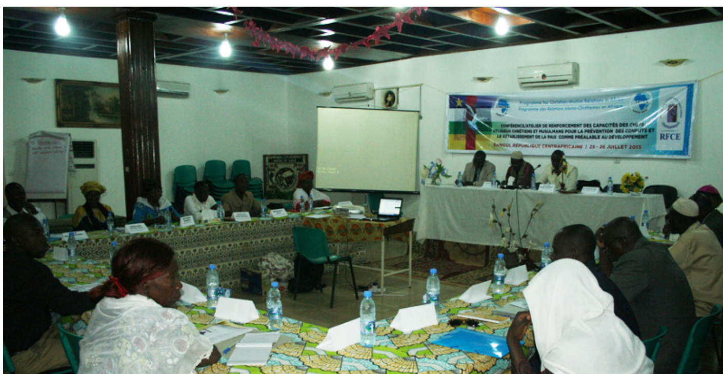
Participants in session

He ended his presentation with emphasis on the principle of peace by example and concluded on this note: “At the end of this insight, the crucial question that we must ask ourselves is whether peace and peaceful coexistence which are very important values in the two communities are being put into practice”.