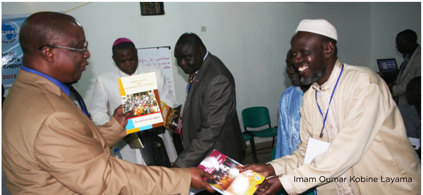
Imam Oumar Kobine Layama