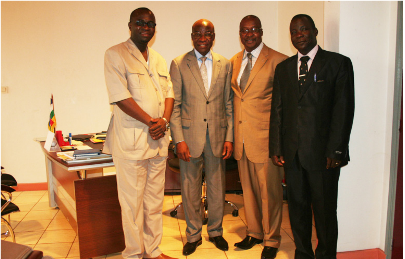
Meeting with the Minister for Territorial Administration and Decentralization, Hon. Aristide Sokambi (second left)