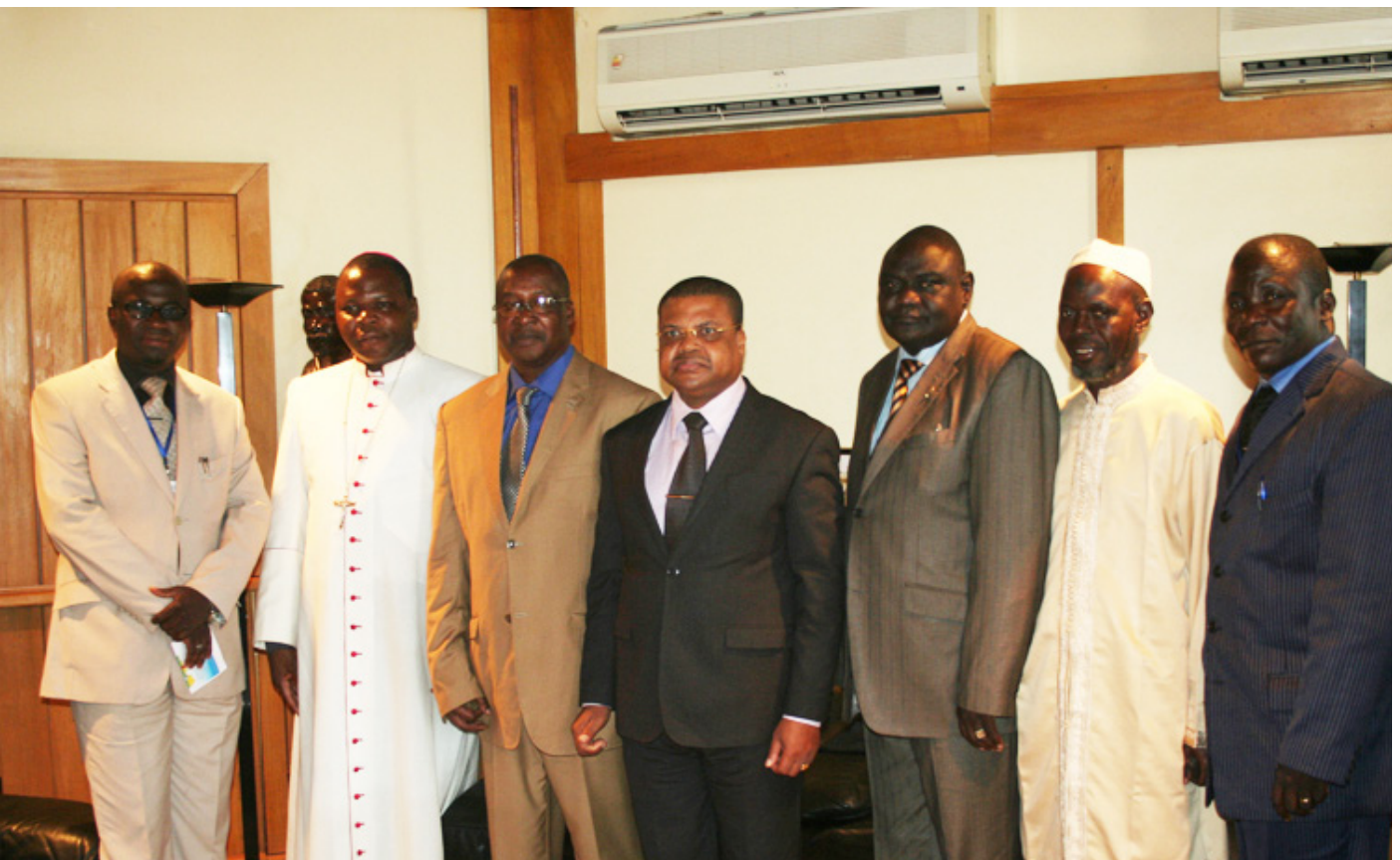
Meeting with the Prime Minister and Head of the Transitional Government, H.E Nicolas Tiangaye(middle)