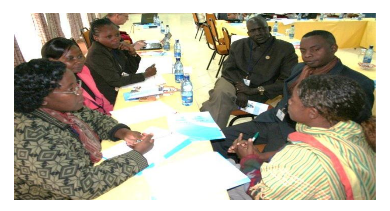
Participants in small group discussion at the conference