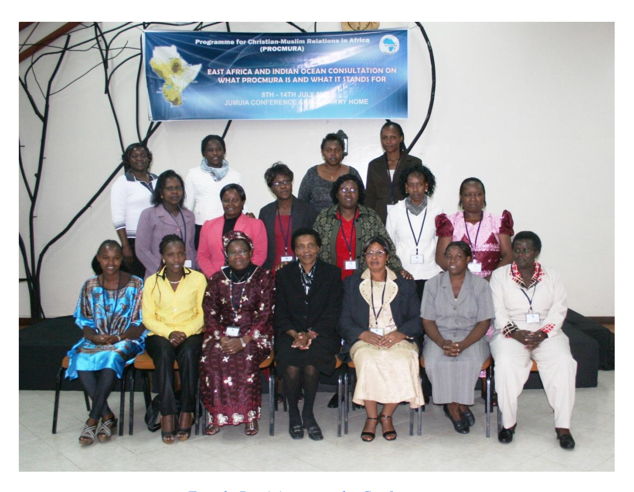
Female Participants at the Conference