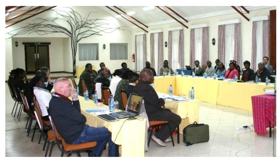
Participants paying keen attention to the General Adviser's address

presentation, it came out clearly that the church in Africa became conscious of the situation in the continent where new changes were being experienced, and therefore started considering how to become self-governing, self-supporting and self-propagating. It was in the area of