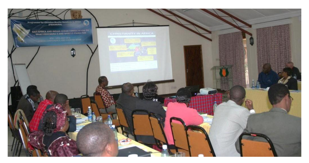
Session of presentation of the critical issues

The General Adviser began with a recapitulation of the previous day's by reminding the participants that Islam is not just a religion but a way of life that is an embodiment of politics, economics, cultural, social as well as spiritual issues. The church in Africa therefore, needs to have a comprehensive approach that considers the above in order to be effective in its resolve to constructively relate with Muslims. He explained that Christians have always separated politics from religion which is not the case for Muslims. He made it clear to participants that since politics and politicians make decisions that govern all people, it was in correct for Christian leaders to advise the lay persons in the churches involved in partisan politics