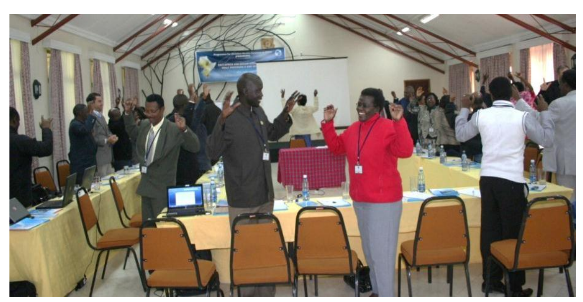
Participants warming up in between the conference's sessions