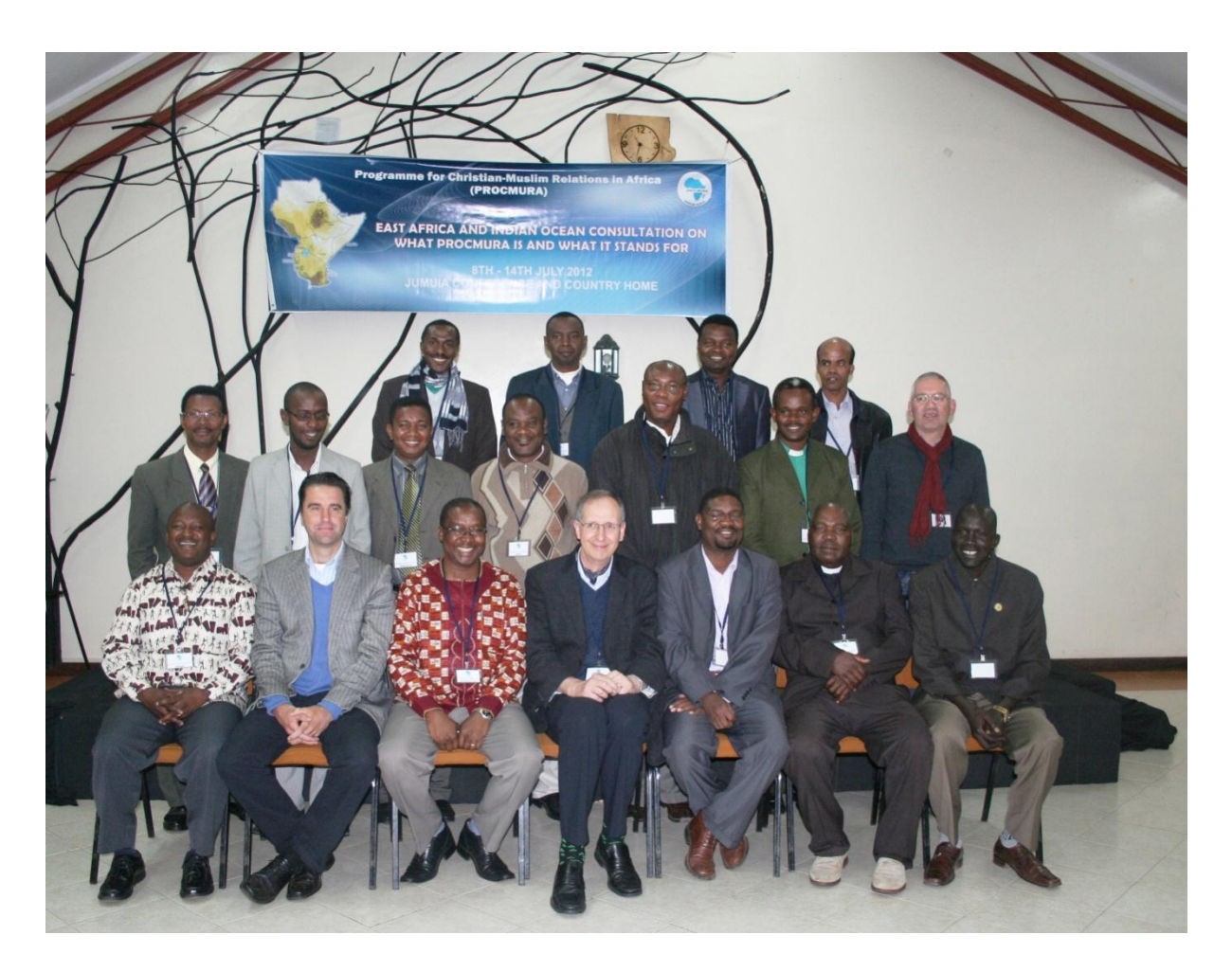
Male Participants at the Conference