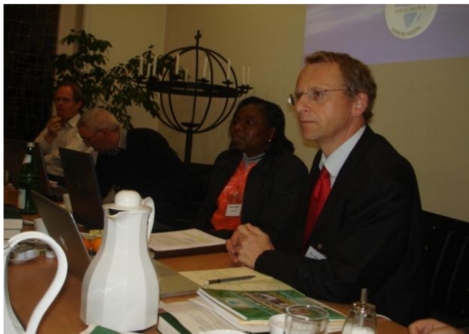
A presentation on PROCMURA during the Africa Secretaries meeting in Germany

PROCMURA collaborates and cooperates with sister and partner organisations that share all or part of its vision. As such the organisation is called upon to share its many years of experience with others so that they may learn from it or offer expertise on what it knows to do best. With this background, we would like to