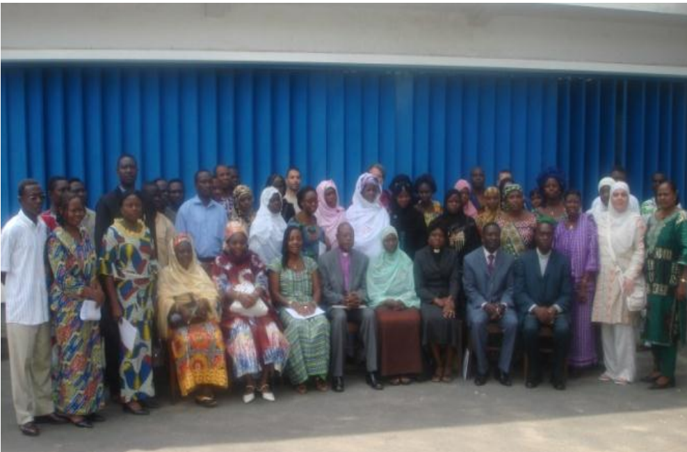
Joint workshop for Christian and Muslim women in Togo on HIV/AIDS

The specific programme is a section under which the programme carries out joint activities (Consultation, workshop) for Christian and Muslim women on social, health and cultural issues that are of common concern to the women. Thus, the programme uses those issues as