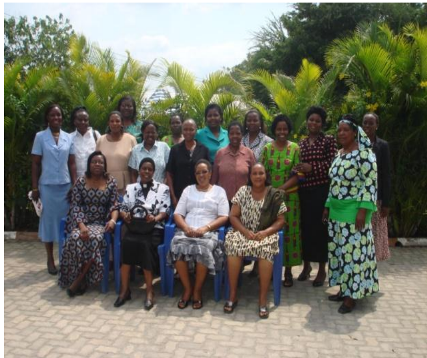
Empowerment workshop for Christian women in Tanzania

The core programme consists of activities (Workshops, seminars, and training) of Christian women only on issues of particular concern to Christian women in Islam and Christian-Muslim relations. In other words, activities here have to do somehow with the two operating principles of the organisation. Hence, women discussed issues of interfaith marriages, received training on the basic tenets of Islam and how to conduct a responsible Christian