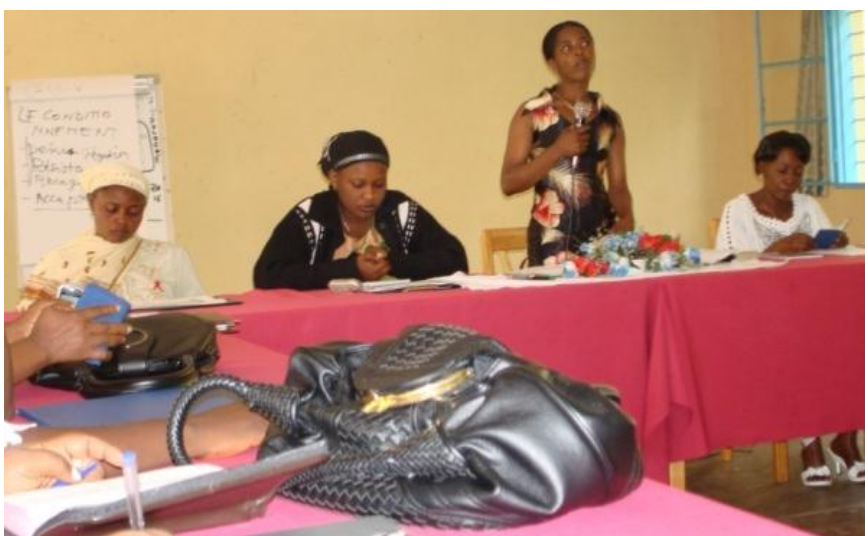
Christian and Muslim women from DRC who participated in the Joint workshop on HIV/AIDS for Central Africa Region

One of the requirements of the Strategic Plan for the Women’s Programme is to expand the Programme to at least five countries. In this regard, the Programme had an activity for the Christian women in Madagascar as introductory, a joint activity for Christian and Muslim women in Burundi and contact are being made with women from DRC to have a joint activity there also.