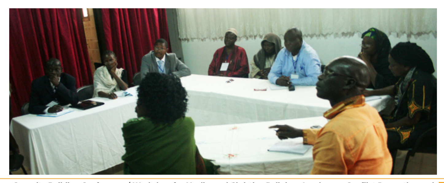
Capacity Building Conference / Workshop for Muslim and Christian Religious Leaders on Conflict Prevention and Peace Building as A Pre-Requisite for Development | Bangui, 25-26 July 2013