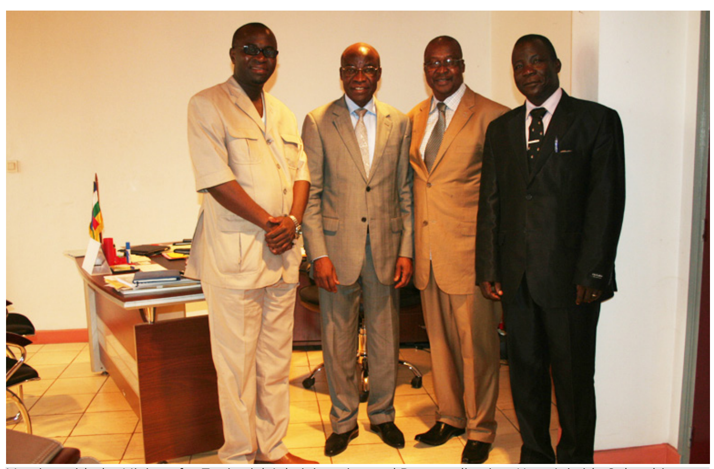
Meeting with the Minister for Territorial Administration and Decentralization, Hon. Aristide Sokambi (second left)