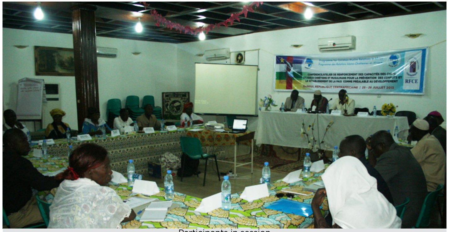
Participants in session

He ended his presentation with emphasis on the principle of peace by example and concluded on this note: "At the end of this insight, the crucial question that we must ask ourselves is whether peace and peaceful coexistence which are very important values in the two communities are being put into practice".