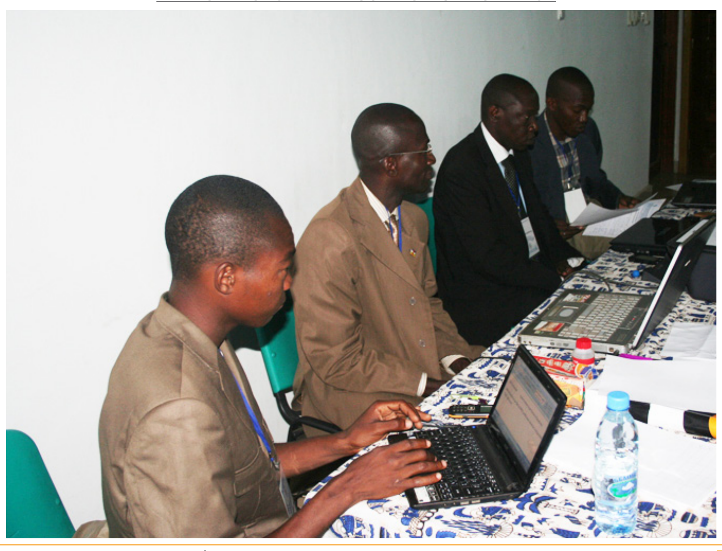
Capacity Building Conference / Workshop for Muslim and Christian Religious Leaders on Conflict Prevention and Peace Building as A Pre-Requisite for Development | Bangui, 25-26 July 2013