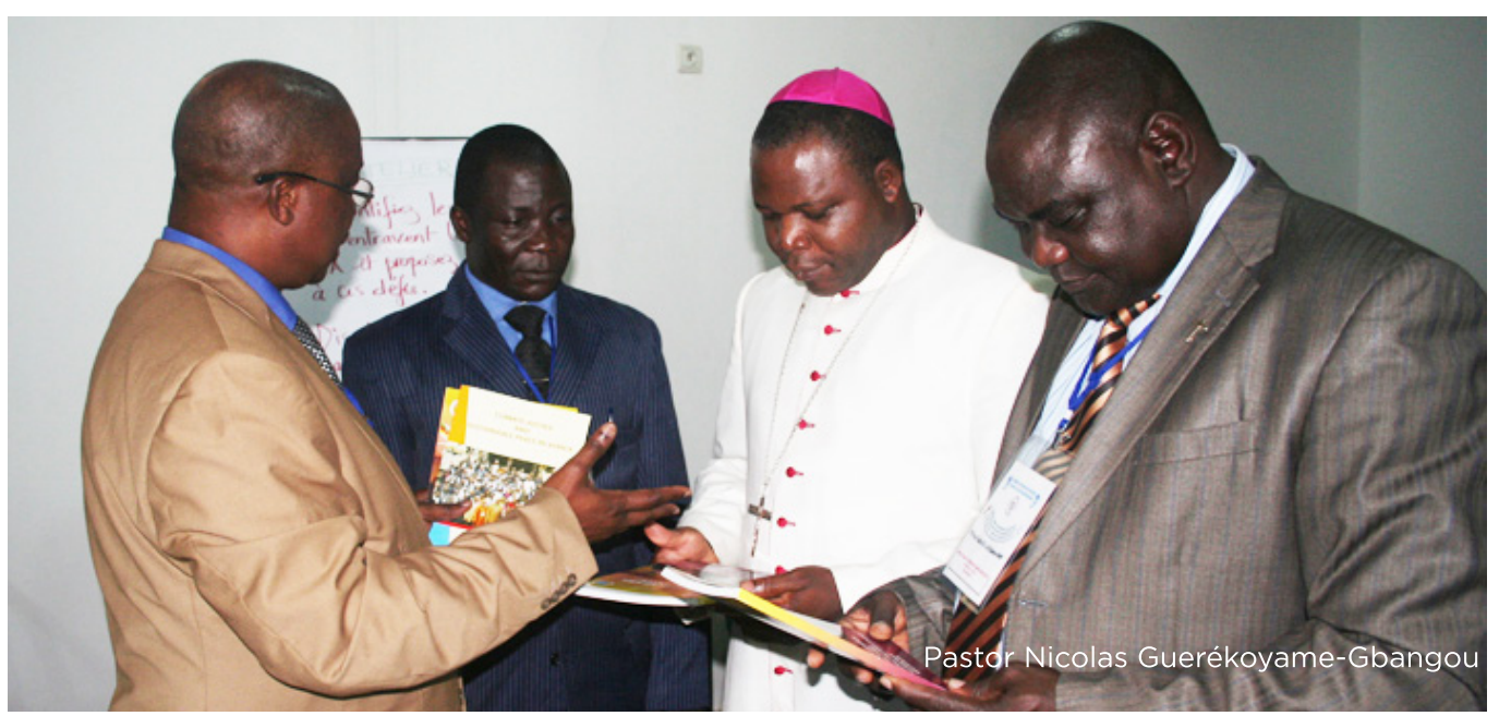
Capacity Building Conference / Workshop for Muslim and Christian Religious Leaders on Conflict Prevention and Peace Building as A Pre-Requisite for Development | Bangui, 25-26 July 2013