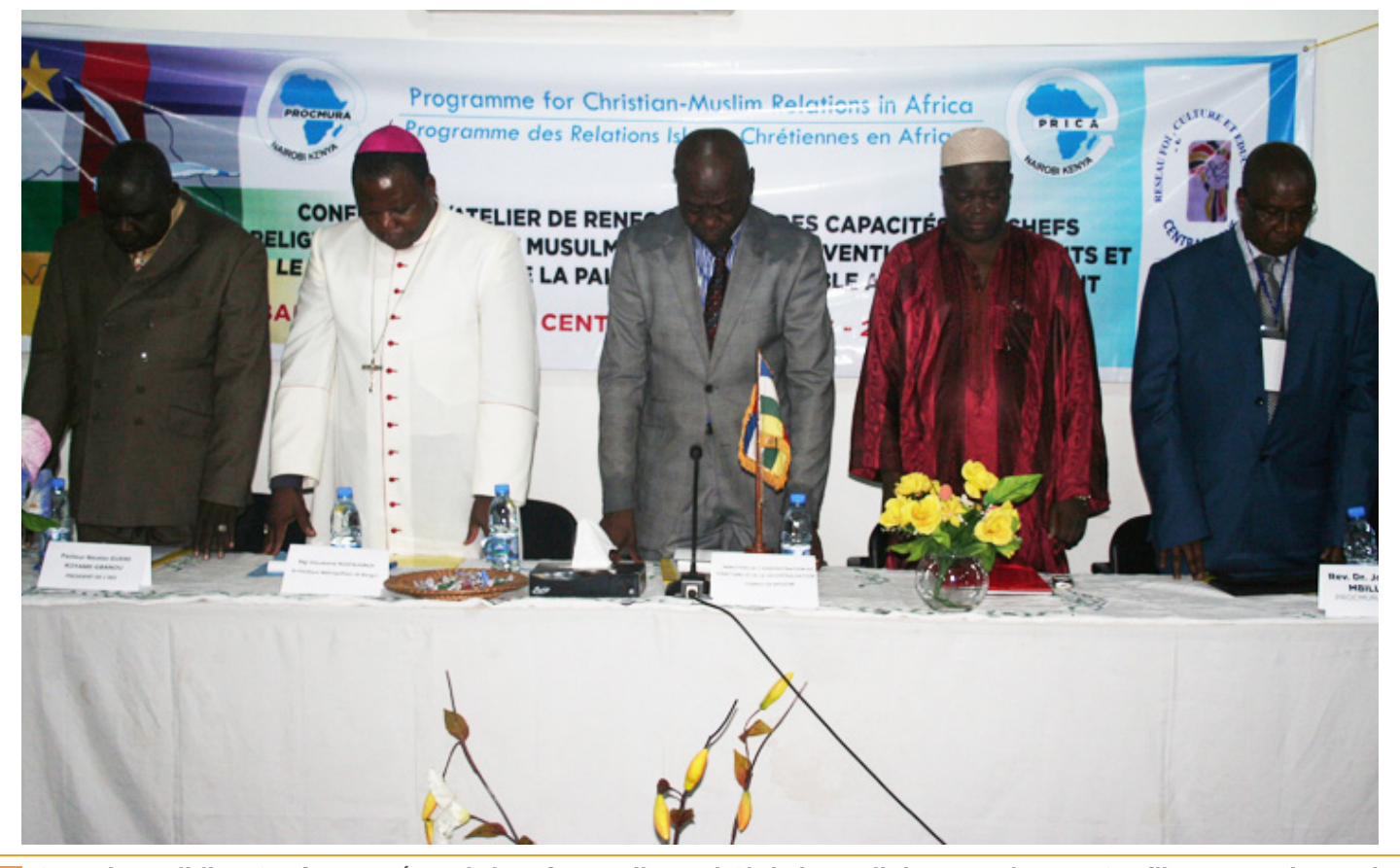
Capacity Building Conference / Workshop for Muslim and Christian Religious Leaders on Conflict Prevention and Peace Building as A Pre-Requisite for Development | Bangui, 25-26 July 2013