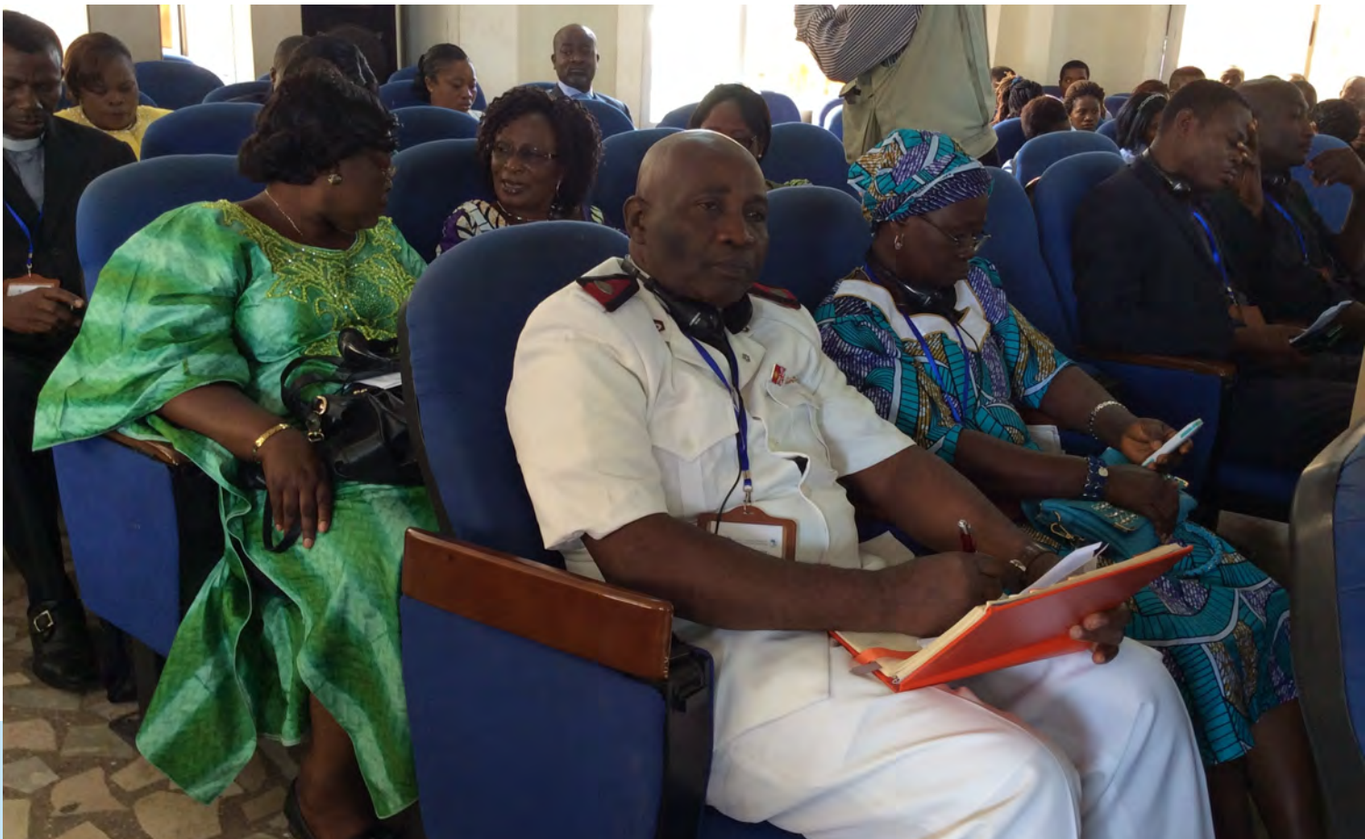
Participants in one of West Africa's PROCMURA sessions

In a separate development, incidences in Niger that caused a stir in the country was the eruption of violence and burning of churches as well as looting of properties of Christians in the capital Niamey and neighbouring counties. This was a reaction of a section of the Muslim community to the Charlie Hebdo magazine's negative portrayal of Muhammad the Prophet of Islam. It needs to be made clear, however, that most of the Muslim communities assisted the Christians and granted shelter to some of them when the violence raged on. Others tried to prevent the Muslim mob from causing more havoc to Churches and properties of Christians.