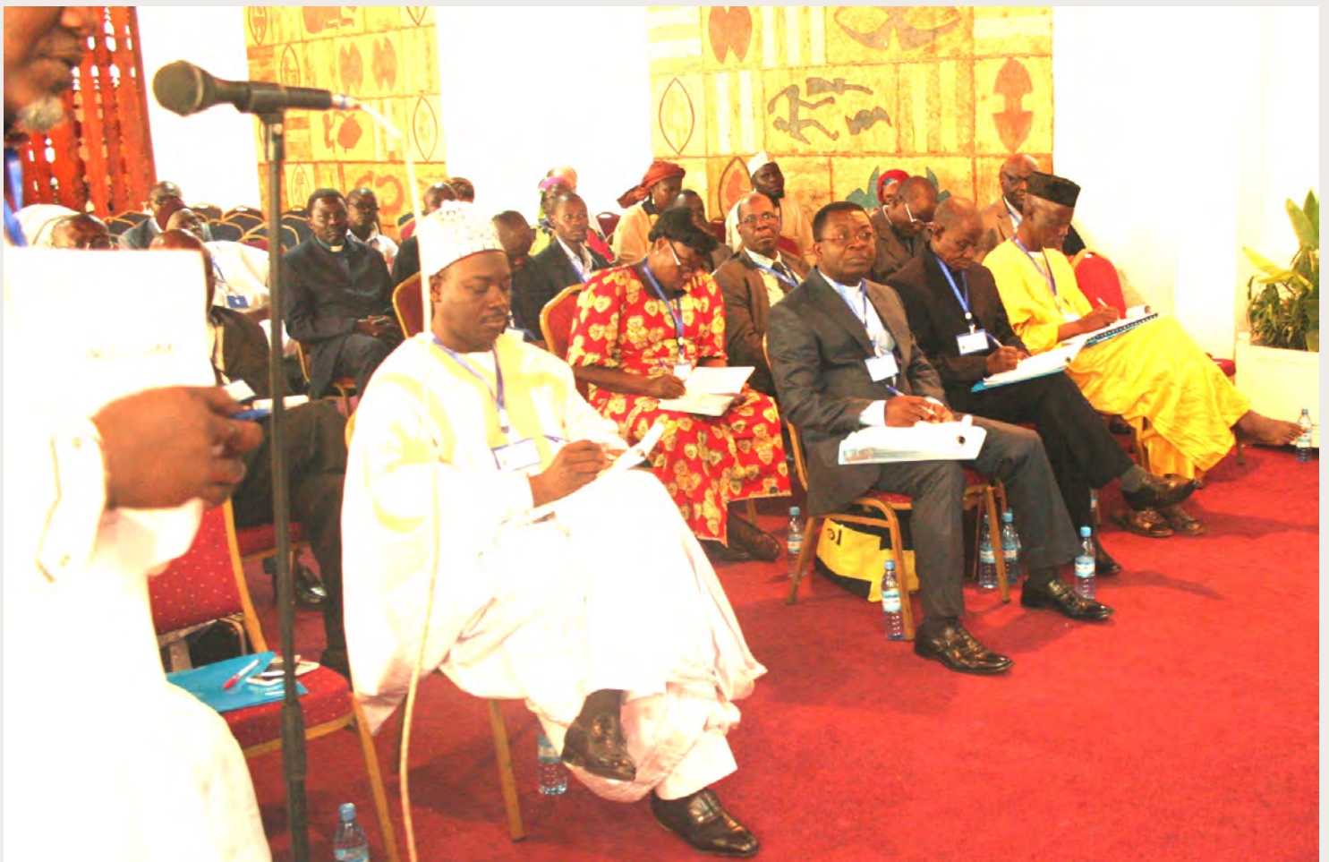
PROCMURA - Christian and Muslim Religious Leaders session in West Africa

In the year under review, we would like to provide a brief overview of challenges in Christian-Muslim relations in West, East and Central Africa and what PROCMURA has done in those places as part of its project oriented programmes on Christian and Muslim constructive engagement for peace in society and peaceful co-existence between adherents of the two religions.