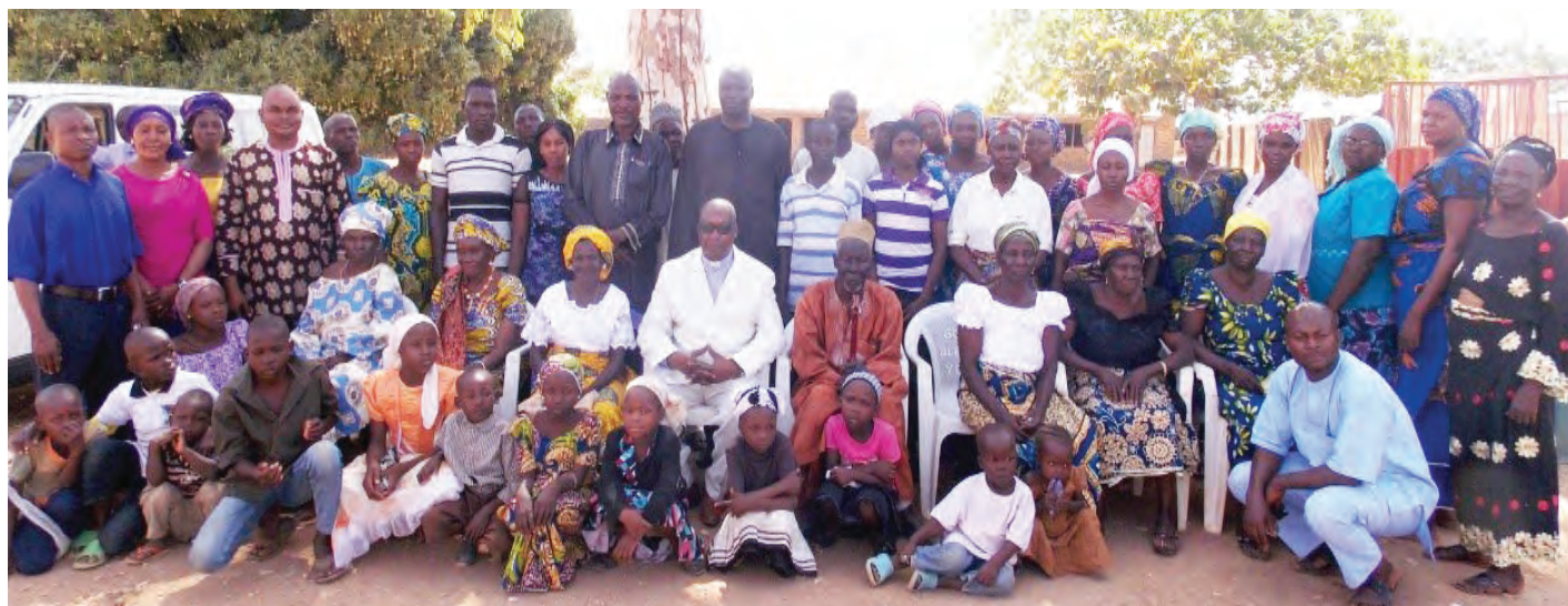
General Adviser (middle in white) in solidarity with IDPs