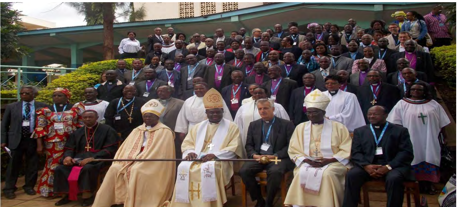
Lutheran Church Leadership Consultation, Tanzania