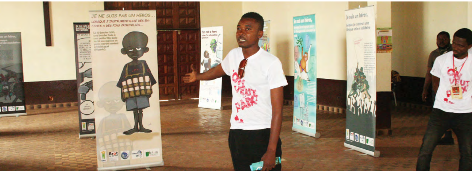
Youth in Cameroon Presenting on Peace

In Christian-Muslim relations, PROCMURA like many other organisations believe that the future belongs to the youth. PROCMURA's Strategic Focus, states clearly that 'the development of the youth for tomorrow's world begins in today's world.' It is this belief that informs PROCMURA's focus on equipping the youth on the complexity of Christian-Muslim relations with the understanding that they will grow to continue what PROCMURA has been doing in an innovative manner commensurate with the challenges of the times. As a result of this, PROCMURA carried out youth educational workshops and seminars in Togo, Uganda and Cameroon.