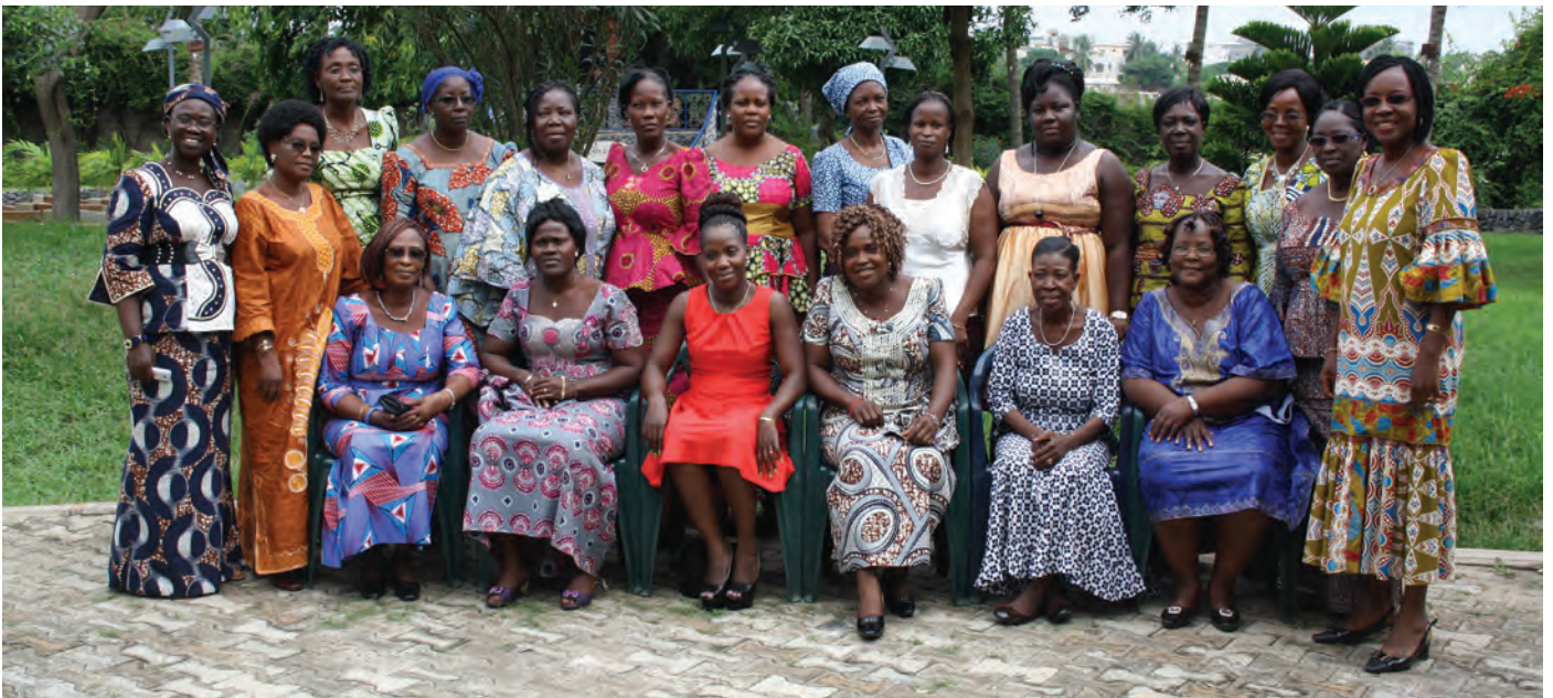
Togo Christian women participants