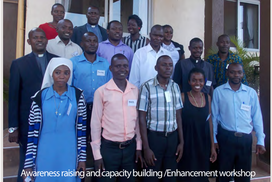
Awareness raising and capacity building /Enhancement workshop

The General Adviser took the youth through guidelines on Christian-Muslim relations, what PROCMURA is and stands for, interfaith marriages and their attendant challenges and issues related to radicalisation and violent extremism in the East Africa region and what the youth needs to do not to be radicalised and instead work with their Muslim counterparts to counter its impact and influence.