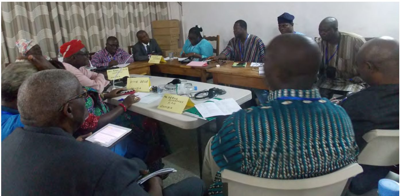
A section of participants in session

For a detailed report on the Togo conference, we refer Partners and our constituencies to the PROCMURA website where the “Lome briefing” is available for reading. A resolution by the Christian and Muslim religious leaders calling on governments, civil society and religious leaders to join hands working together to deal with the threat of violent extremism was issued. This can also be found on the PROCMURA website under the heading “Lome Communiqué”.