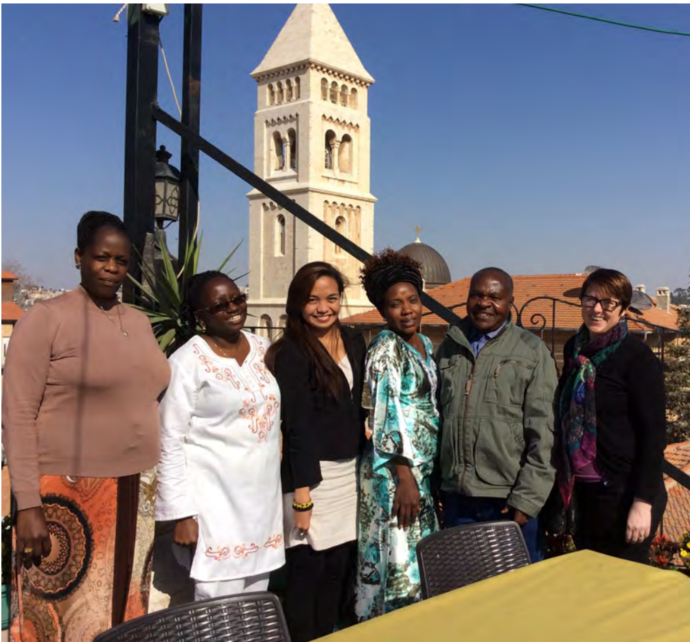
The Team Leader, Finance and Administration (3rd from right) with Leadership Training participants

We thank our Partner, Church of Sweden and the Swedish Institute for the opportunity granted us in PROCMURA, and implore them to continue to remember us in this yearly programme.