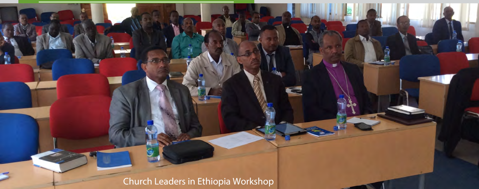
Church Leaders in Ethiopia Workshop

We are delighted about this move even as we hope that it will help spread PROCMURA's work in the country.