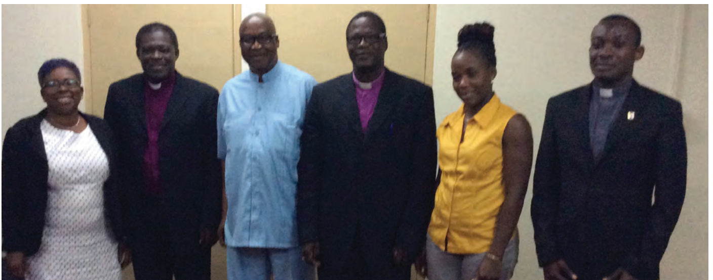
PROCMURA Team with some of the Christian Council of Ghana Staff