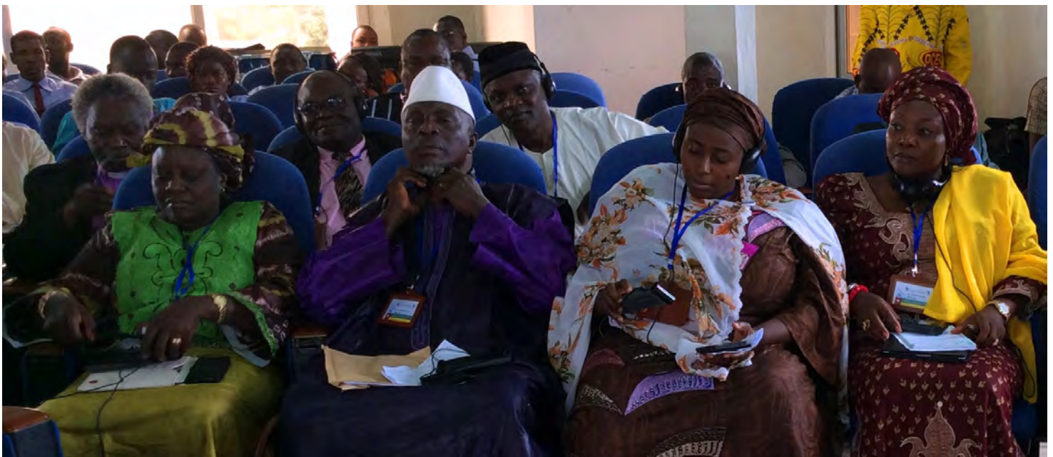
Participants in one of West Africa's PROCMURA sessions

A break-away group from AQIM who refer to themselves as Jamā at al-tawhīd wal-jihād fi gharb afrīqiyā translated as "Movement for Oneness and Jihad in West Africa" (MOJWA) has indicated that it intends to spread violent jihad across a larger section of West Africa. There is a lot of concern about the group, but not much has been heard about them since their declaration of intent.