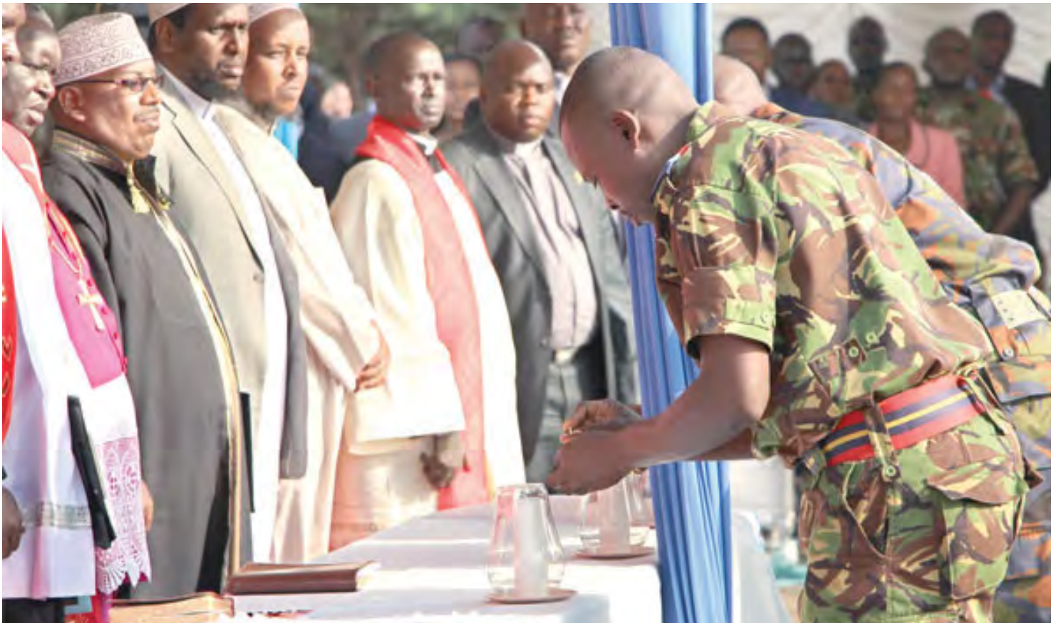
Memorial Service in Eldoret for victims of Al-shabab violence

This tragedy (as may be expected) created so much rage among Kenyans with the Christian Community expressing anger that Christians were again the target as was the case in other attacks in the past few years. The Muslim leaders condemned what had happened and accelerated measures within their communities to curb violent extremism. Tanzania was also put on alert when it was revealed that one of the attackers was a Tanzanian.