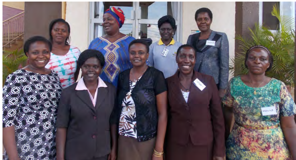
A section of Women Church Leaders Participants

An evaluation carried out thereafter, called on PROCURA to come up with a programme that would bring both Christians and Muslims together to look at various issues related to women in Christian-Muslim relations especially the growing radicalisation in the region and women contribution to counter the alarming trend.