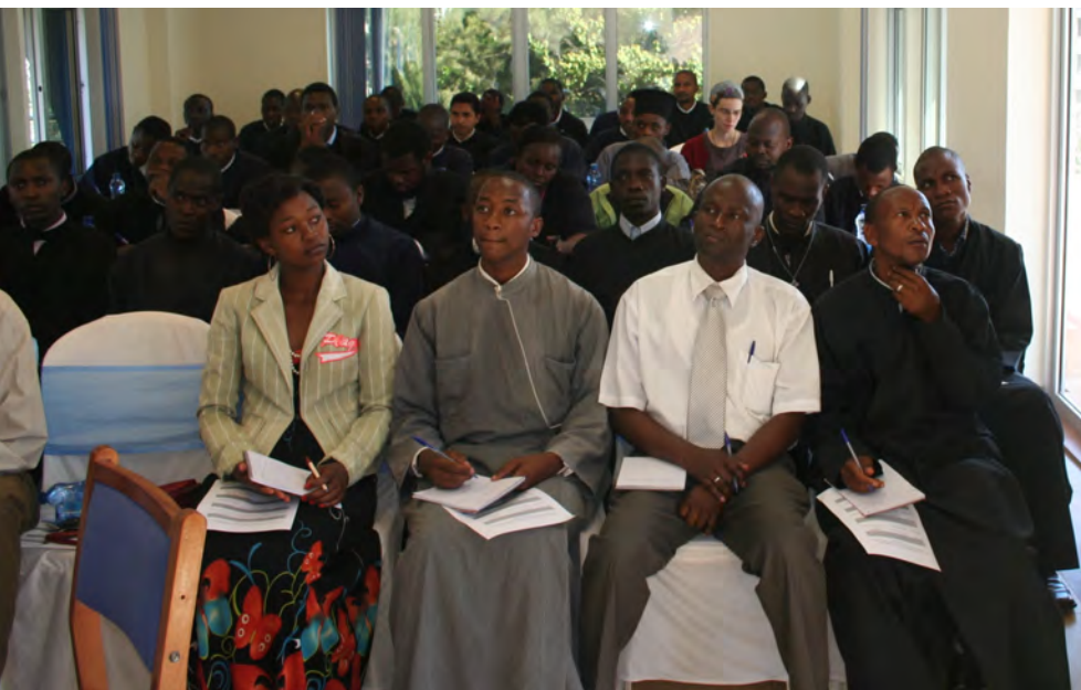
A section of participants following the proceedings of the seminar