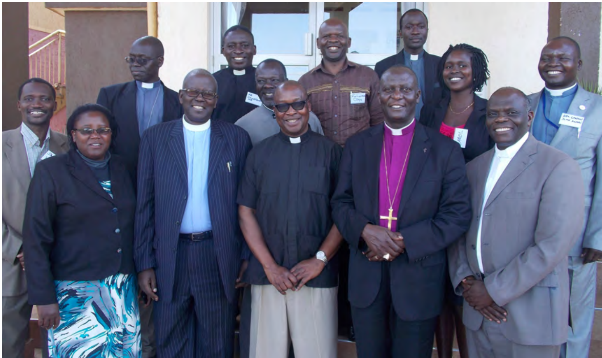
Church Leaders workshop in Uganda