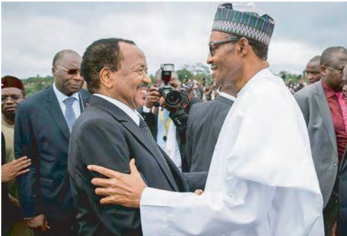
H.E Paul Biya (left) President of Cameroon and H.E Muhammad Buhari (right) President of Nigeria meet to confer on Boko-Haram

Apart from Boko Haram's violent activities, the other worrisome issue that impact on Christian-Muslim relations in the region is the well-known Séléka and anti-Balaka violent activities in the Central African Republic. A political solution is envisaged as presidential and parliamentary elections took place. There was no outright winner so a runoff is planned for 2016.