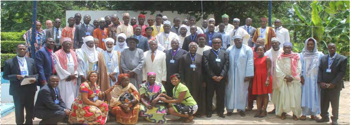
Participants at the Garoua Conference

In the year under review, PROCMURA had a strong focus on these but could not raise more resources to do more. In reporting this aspect of our work, we propose to summarise what we have been able to do since more detailed reports were sent to partners earlier, and can also be found in the PROCMURA website. We also standby to send such reports to partners and friends who may want to read them.