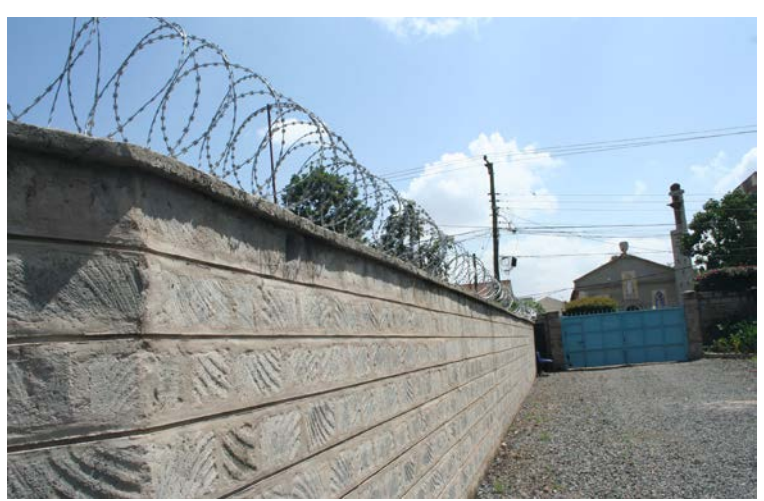
Intruder barbed wire

Thank you all for this very practical show of concern and solidarity.