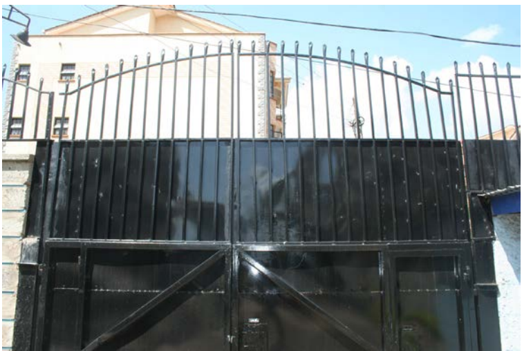
High-raised metallic gate