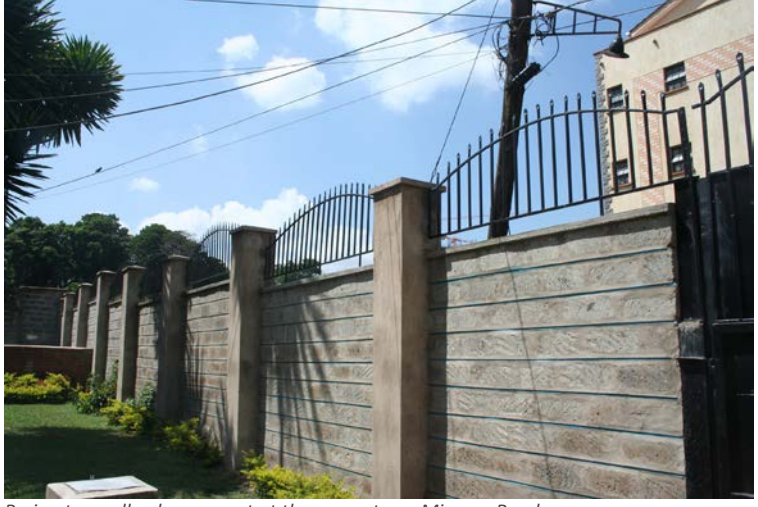
Perimeter-wall enhancement at the property on Mimosa Road