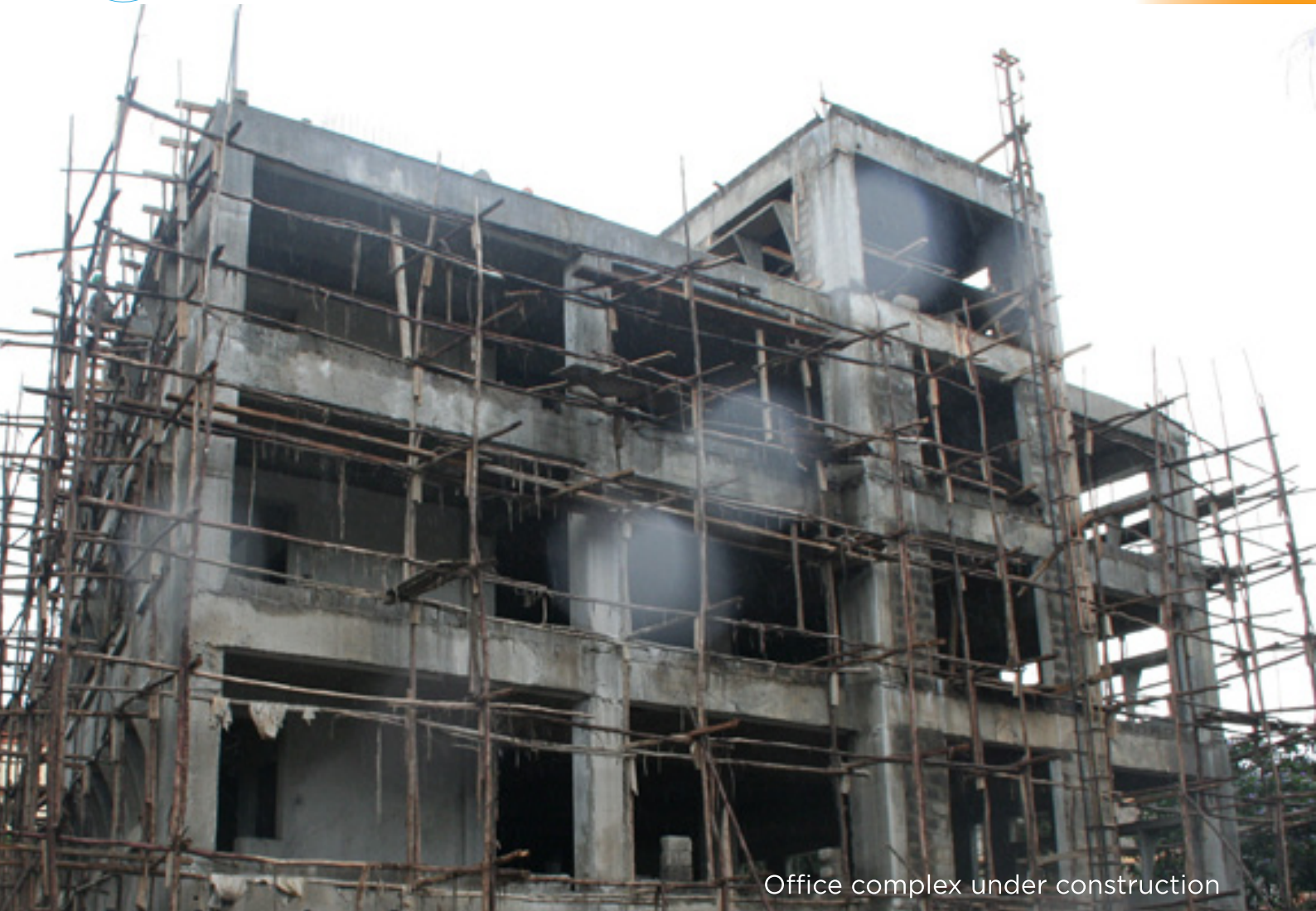
Office complex under construction

To all our partners, we would like to let you know that our doors remain open for suggestions and commitments of goodwill that would enable us to complete the office complex with less financial burden hanging on our shoulders. This will help us to financially redeem ourselves earlier than later and pave the way for a rapid financial ease on PROCMURA overhead cost.