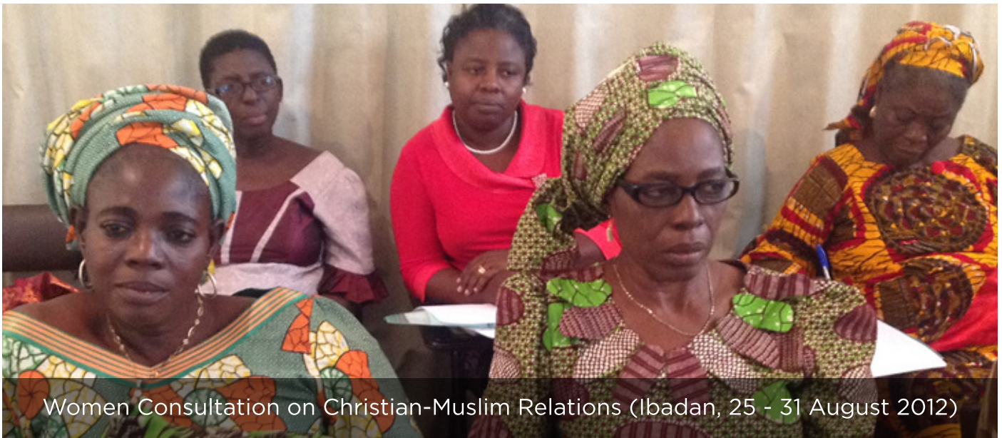
Women Consultation on Christian-Muslim Relations (Ibadan, 25 - 31 August 2012)