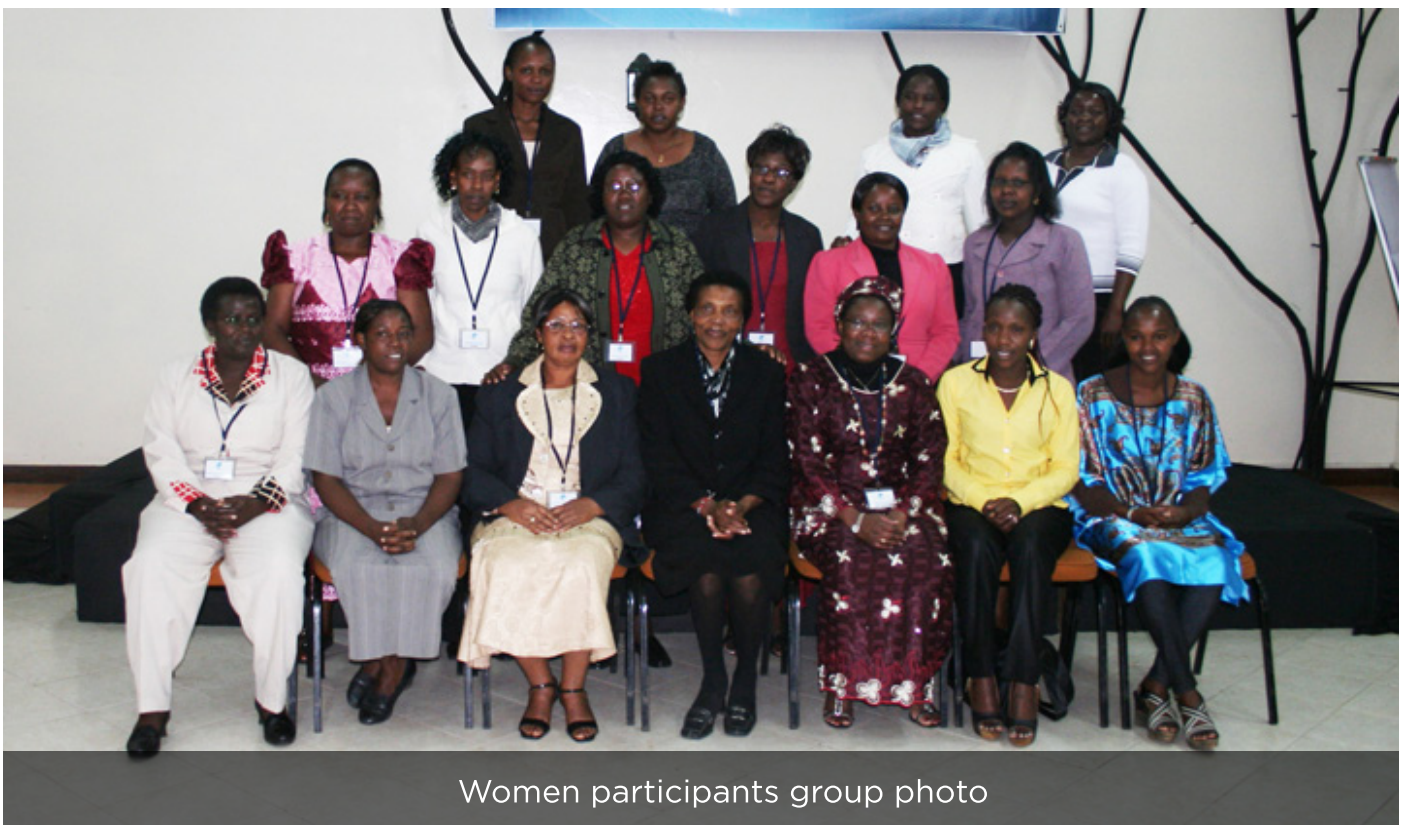
Women participants group photo

For detailed report on this innovative encounter of minds on women issues in Christian-Muslim relations see the detailed report see ICMR Alumni Report 2012 on http://www.procmura-prica.org/ICMR-Women-Alumni-Report.pdf