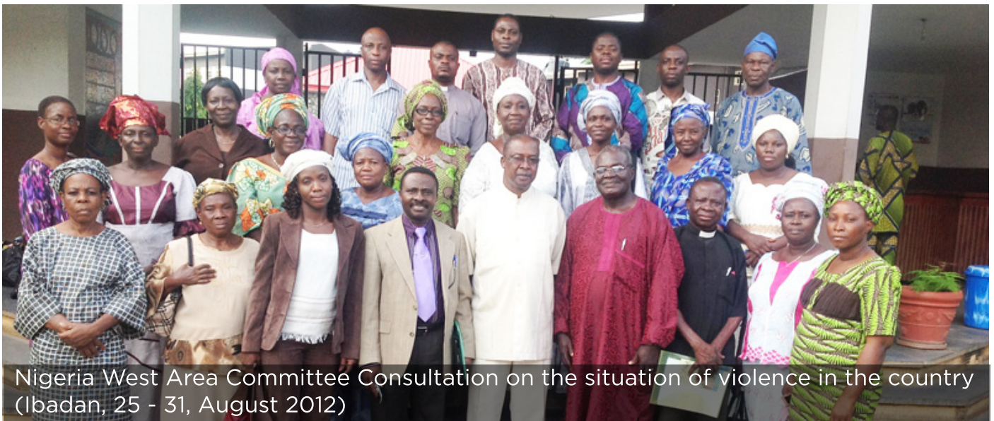
Nigeria West Area Committee Consultation on the situation of violence in the country (Ibadan, 25 - 31, August 2012)

The Nigeria West Area Committee had undergone various changes leading to the reorganisation of the Area Committee. As it is custom for PROCMURA to provide orientation to new Area Committee members, a one day (August 27th) orientation course was conducted for the Area Committee. The General