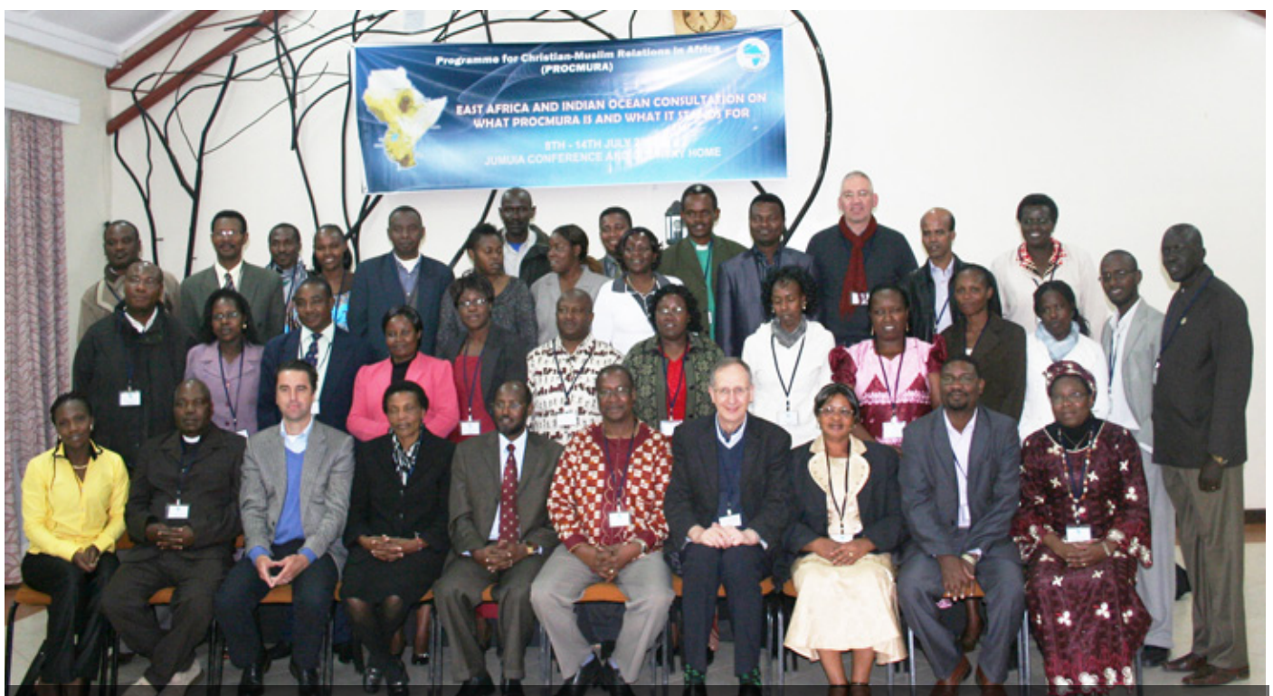
Participants at the consultation, Jumua Conference and Country Home (8 - 14 July 2012)

http://procmura-prica.org/EAST-AFRICA-AND-INDIAN-OCEAN-CONSULTATION-REPORT-JULY-2012.pdf