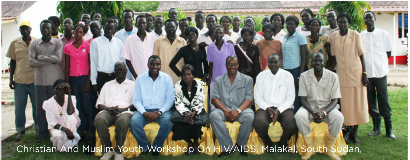
Christian And Muslim Youth Workshop On HIV/AIDS, Malakal, South Sudan,

An HIV and AIDS prevention and management workshop was held for over thirty (30) Christian and Muslim youth of the Upper Nile State of South Sudan in Malakal from 9th to 11th September. The urgent need for this workshop