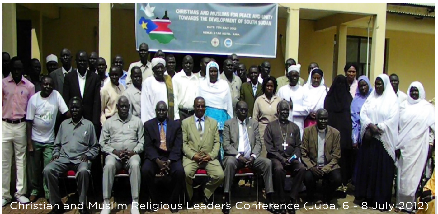
Christian and Muslim Religious Leaders' Conference (Juba, 6 - 8 July 2012)

At the end of the conference, participants vowed to look forward and to ensure that Christian-Muslim relations in South Sudan becomes a model that will contrast what was experienced when the two Sudans were one