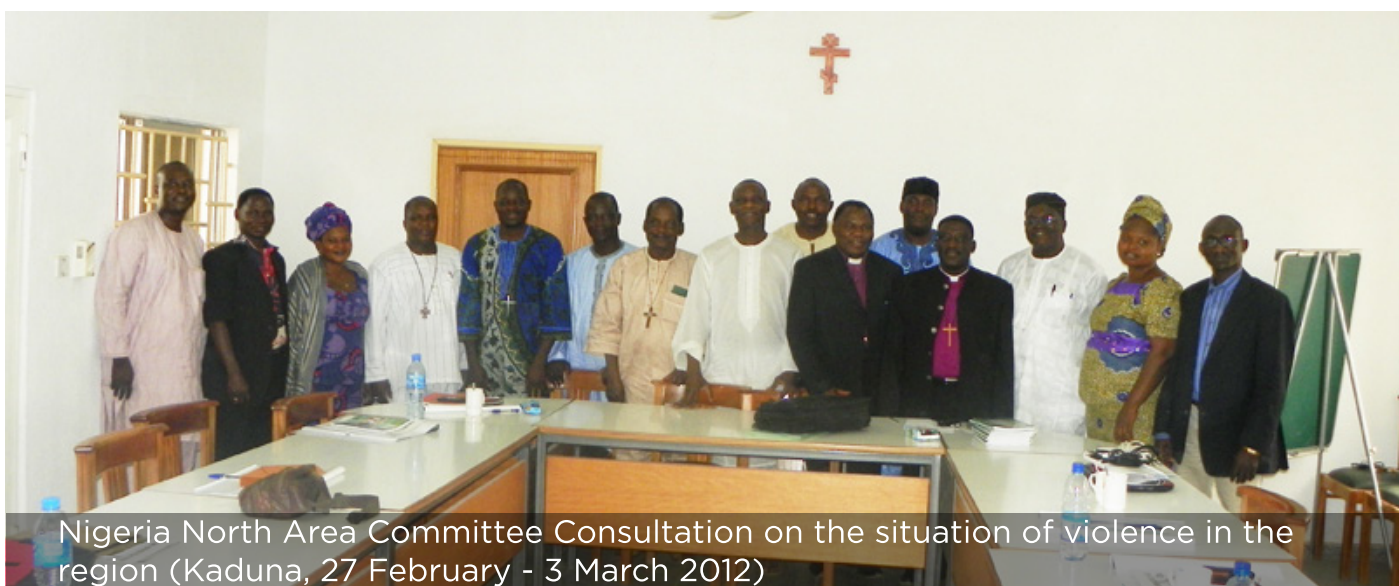
Nigeria North Area Committee Consultation on the situation of violence in the region (Kaduna, 27 February - 3 March 2012)

Comprehensive recommendations documented by PROCMURA in the consultation in addition to previous recommendations gathered in other PROCMURA gatherings in Nigeria inform our approach to the situation in that country in general and the northern and middle belt areas in particular.