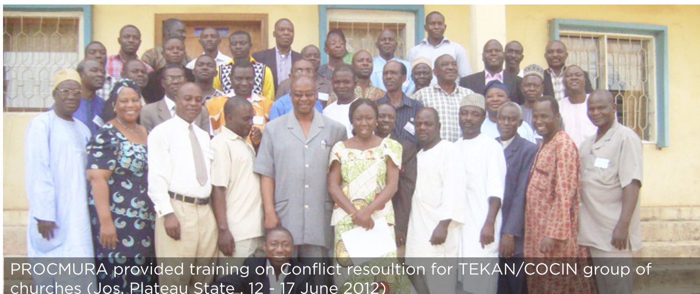
PROCMURA provided training on Conflict resolution for TEKAN/COCIN group of churches (Jos, Plateau State , 12 - 17 June 2012)

The importance of the workshop in the work of PROCMURA cannot be overemphasised both in terms of the input PROCMURA brought to