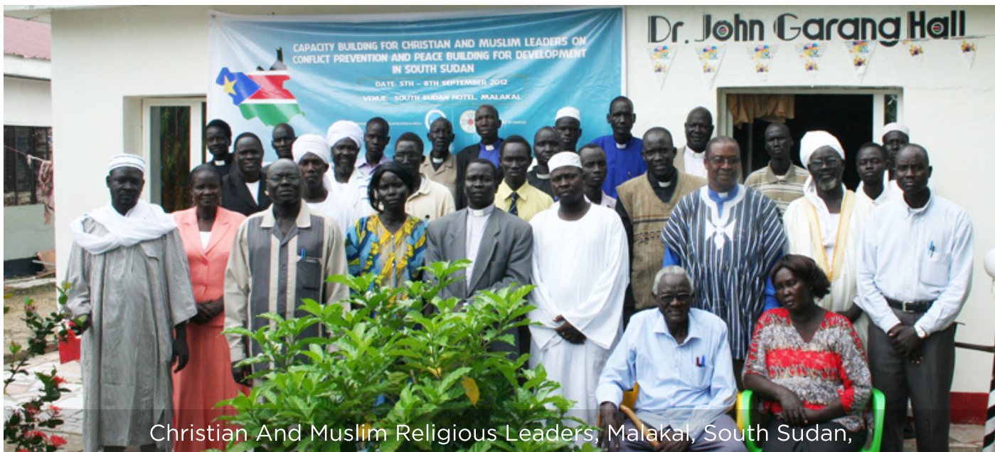
Christian And Muslim Religious Leaders, Malakal, South Sudan,

As part of its continuous commitment for Christians and Muslims of South Sudan to work together for peace and development, PROCMURA organised a conference that was attended by thirty (30) Christian and Muslim religious leaders of the Upper Nile State of South Sudan. The conference which focused on capacity building for conflict prevention and for peace building and reconciliation for development attracted state authorities who also participated. The enthusiasm at the conference was firmly demonstrated by the determination of participants to brave rain storms to participate in the conference. In a communiqué issued after the conference, participants committed themselves to work together for the prevention of conflict and promote reconciliation among different ethnic groups, and constructive relations between Christians and Muslims in the new nation. For details of the Malakal Communiqué on: http://www.procmura-prica.org/Malakal_Communique.pdf