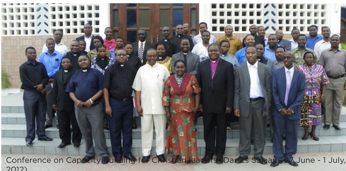
Conference on Capacity Building for Christian leaders (Dar Es Salaam, 27 June - 1 July, 2012)

The General adviser took the opportunity of his presence in Zanzibar to