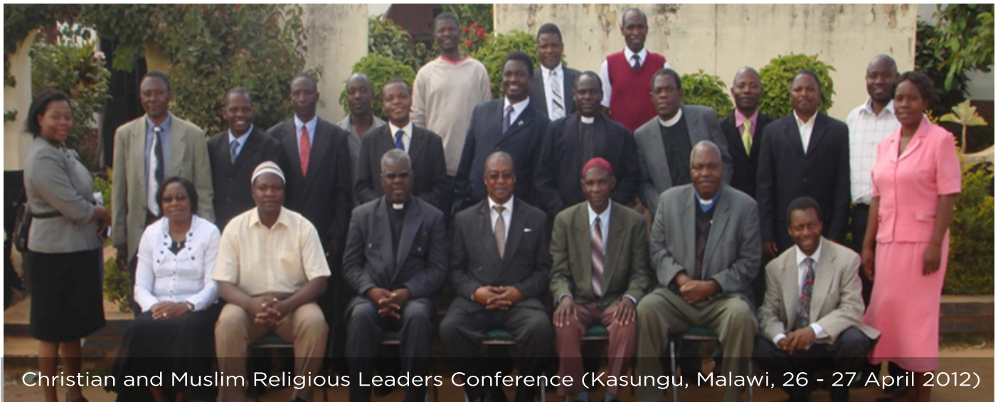
Christian and Muslim Religious Leaders Conference (Kasungu, Malawi, 26 - 27 April 2012)

As part of its focus on peace for development, PROCMURA organised a Christian and Muslim religious leader's three-day conference on peace and development. The Religious leaders' conference was preceded by a Christian and Muslim women leader's workshop to identify what women consider to be the most telling issues that could militate against peaceful co-existence between Christians and Muslims in Malawi. The conferences took place from 24th to 27th April.