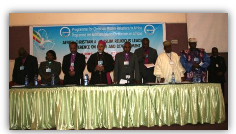
Dignitaries present for the opening ceremony stand up in show of respect for the opening prayers.

The theme of the conference "Africa Christian and Muslim Religious Leaders for Peace