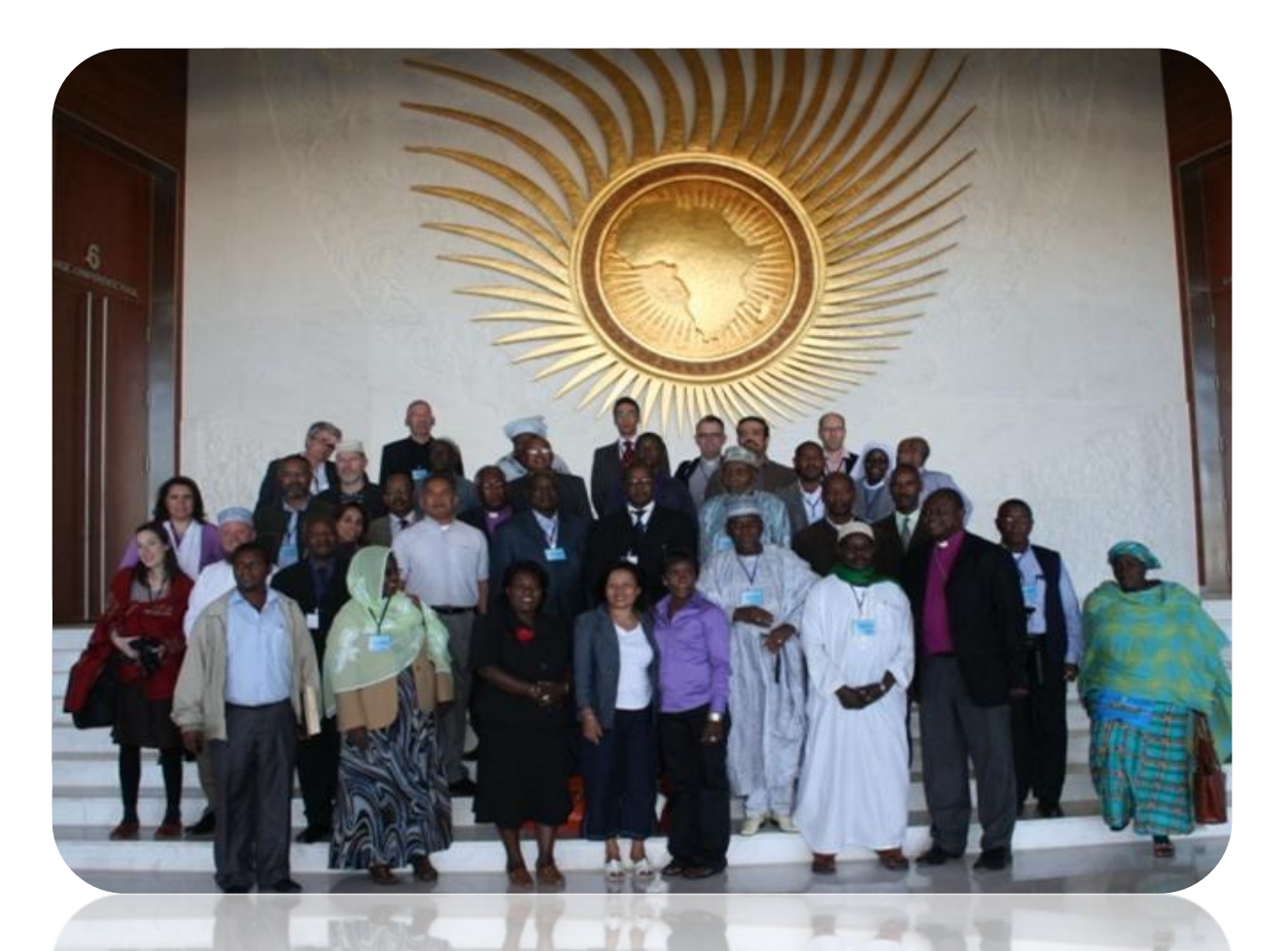
Participants pose inside the new African Union (AU) building

In addition, the sessions also included a visit to the Orthodox Church and the Mosque in Addis Ababa. The crown jewel though, was a visit to the new African Union building where prayers were offered in anticipation of the 18th Summit of the African Union.